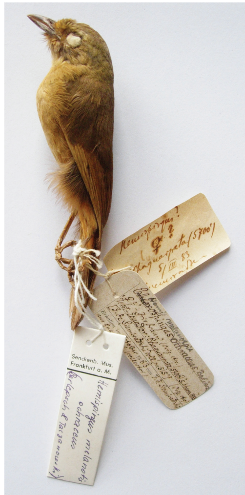
Figure 1. Lateral view of SMF 58282, the only surviving syntype of Sphenopsis ochracea (von Berlepsch & Taczanowski, 1884), collected by Siemiradzki at Chaguarpata, Chimborazo, Ecuador, on 5 March 1883. The original field label reads: ‘ Hemispingus? / ♀? / Chaguarpata (5700’) [= 1,737 m] / 5/III 83 / Siemiradzki’. The identification on the secondary (Berlepsch) label reads: ‘ Chlorospingus [in black ink] ochraceus , Berl. & Tacz. [in pencil]’, with ‘ Chloro ’ crossed out and replaced by ‘ Hemi ’ in pencil, and ‘ melanotis ’ in pencil

Several points of confusion have arisen from the analyses of García-Moreno et al. (2001), which demand explanation. Renssen (2007) quoted this paper in SACC Proposal 284: ‘Within our limited sampling, we could not detect any differences to warrant separation of the east- and west-slope subspecies melanotis and ochraceus , neither at the molecular level nor based on the plumage characters’ (García-Moreno et al. 2001). However, this statement was unfounded because the S. ochracea samples in their study (MECN 5265 and 5267) were evidently not included in their morphological or phylogenetic analyses. Both vouchers were juveniles (i.e., unsuitable for analysis of plumage colour in adults) and deposited at MECN (N. Krabbe in litt. 2022); they were therefore unavailable to García-Moreno et al. (2001), whose morphology analysis was based on ‘[vouchered adult] specimens from the National Museum of Natural History (Stockholm) and [the Zoological Museum, Natural History Museum of Denmark] ZMUC’ (both of which lack specimens of S. ochracea ). Furthermore, although the MECN samples were mentioned in the Methods and Discussion sections, they were absent from all phylogenetic analyses presented in the Results, including the table of genetic distances (see Figs. 2–4 and Table 1 in García-Moreno et al. 2001). Omission of these samples, and the ‘undescribed’ sample discussed below (ZMUC 104925), may also explain why they