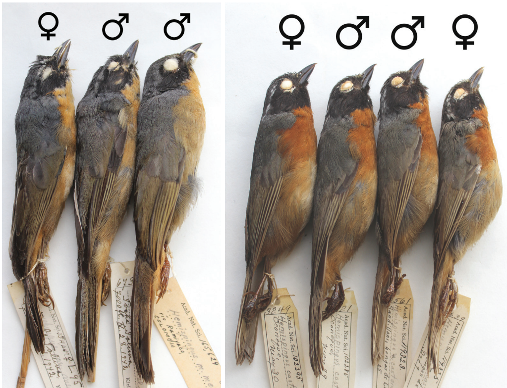
Figure 3 (left). Lateral view of (Northern) Black-eared Hemispingus Sphenopsis melanotis melanotis (P. L. Sclater, 1855). From left to right, (1) ANSP 154444, adult female prepared by Kjell von Sneidern on 25 April 1942 at 'Toche, Tolima, Colombia'. (2) ANSP 154443, adult male, prepared by Kjell von Sneidern on 28 April 1942 at 'Toche, Tolima, Colombia'. (3) ANSP 165629, adult male, collected on 30 November 1950 on the 'Rio Rumiayaco, [Nariño] Colombia' (Matthew R. Halley)