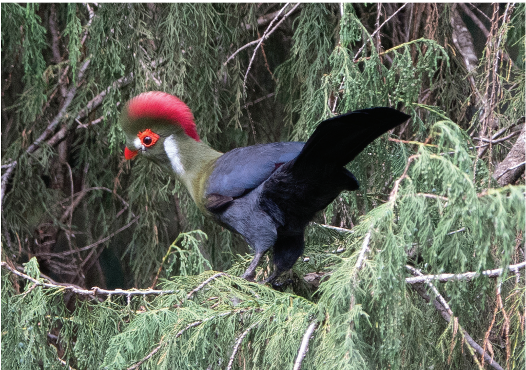
Figure 2. Crimson-crested Turaco Menelikornis (l.) donaldsoni , near Agarfa, June 2019; a bird obviously in a state of intense arousal with the bright crimson crest very striking (Kai Gedeon)