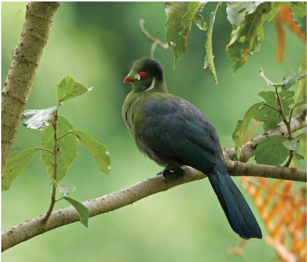
Figure 4. White-cheeked Turaco Menelikornis (l.) leucotis , Wondo Genet, east slope of the Rift Valley; note differences in size of white cheek patches and mantle colour compared to donaldsoni in Fig. 2

but there are no published studies of this in leucotis . Our own sound-recordings are unfortunately unsuitable for proper analysis. However, it may be worthwhile to explore possible differences in the vocal structure when high-quality recordings from the contact zone become available.