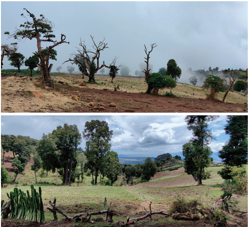
Figure 7a (above). Remnants of Podocarpus forest in the Oda Mts., which are heavily cultivated by smallholders. Crimson-crested Turaco Menelikornis (l.) donaldsoni survives here, despite the advanced state of habitat degradation. Figure 7b (below). Another former forest in an irreversibly devastated state, May 2021

rifles'. In this context, a vernacular honorific appears inappropriate. Moreover, given the brilliant colour of the erect crest shown in Fig. 2, the name Maroon-crested Turaco used by del Hoyo & Collar (2014) seems less appropriate than Crimson-crested Turaco, which we here propose for donaldsoni .