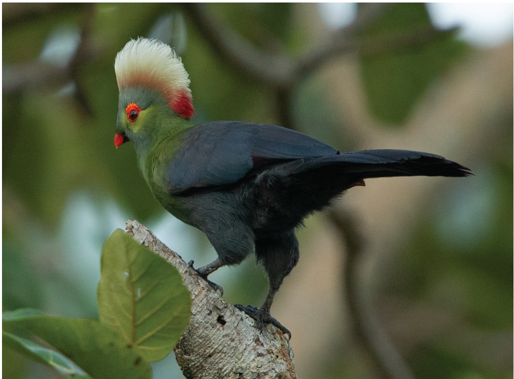
Figure 5. Ruspoli's Turaco Menelikornis ruspolii , near Negele, south-east Ethiopia