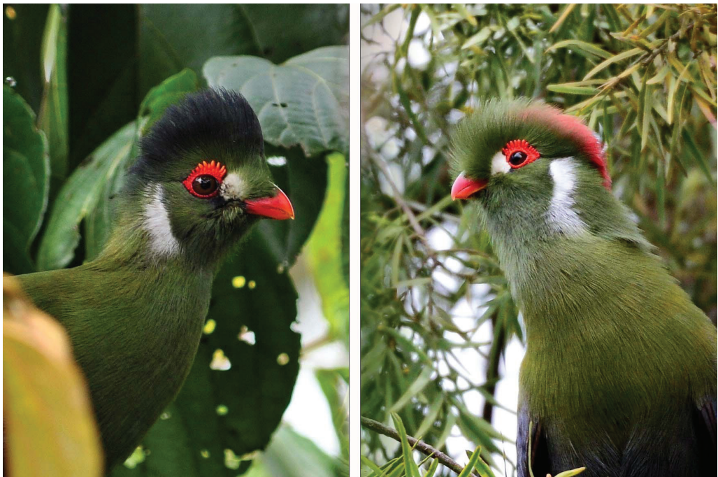
Figure 6. Left White-cheeked Turaco Menelikornis (l.) leucotis at Yergalem, south of Awasa, and right Crimson-crested Turaco M. (l.) donaldsoni at Goro Gutu, west of Harar; here only minor differences in the size of the cheek patches and peri-ocular wattles are apparent