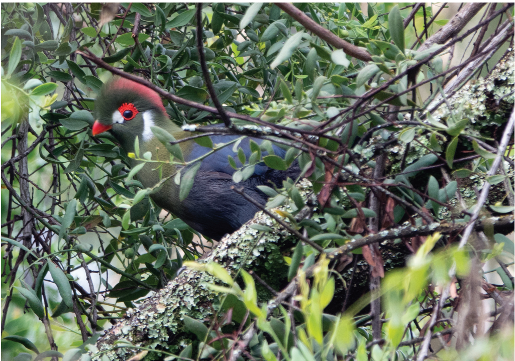
Figure 3. Crimson-crested Turaco Menelikornis (l.) donaldsoni , near Agarfa, May 2021; usually the crest coloration is less conspicuous when it is only slightly erected or not at all, as here (Kai Gedeon)