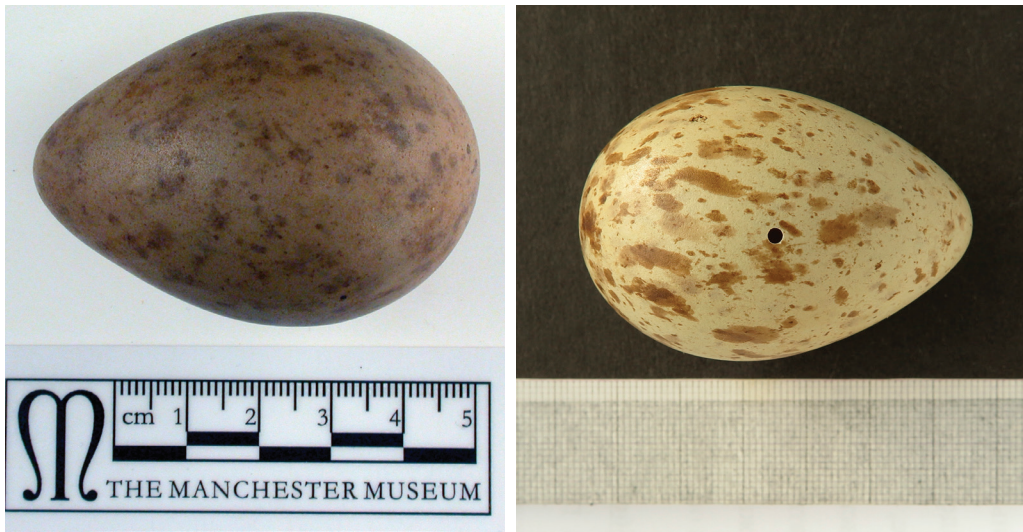
Figure 4 (left). Egg of Slender-billed Curlew Numenius tenuirostris from the Manchester Museum (MANCH BB.5660.2539; egg F)