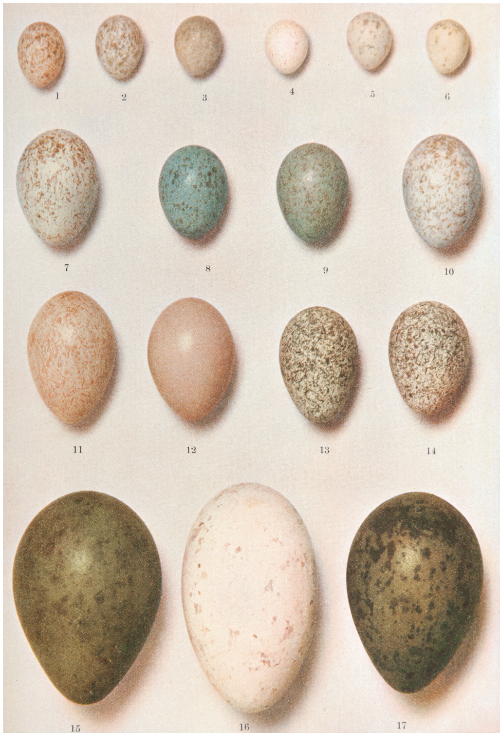
Figure 3. Pl. 224 from Dresser (1905–10) showing the Manchester egg (egg F, = no. 15) and the Shastovski egg (egg E, = no. 17)