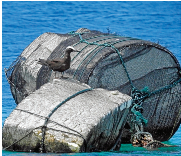
Figure 10. Black Noddy Anous minutus , off Rani, 6 August 2015

Status Occasional visitor. Seasonally common in New Guinea waters (Beehler & Pratt 2016); recently found breeding on the Hermit Islands (Bishop & Hacking 2020). 6 August 2015: an adult photographed off Rani (N. Voaden, eBird checklist S24512191; Fig. 10).