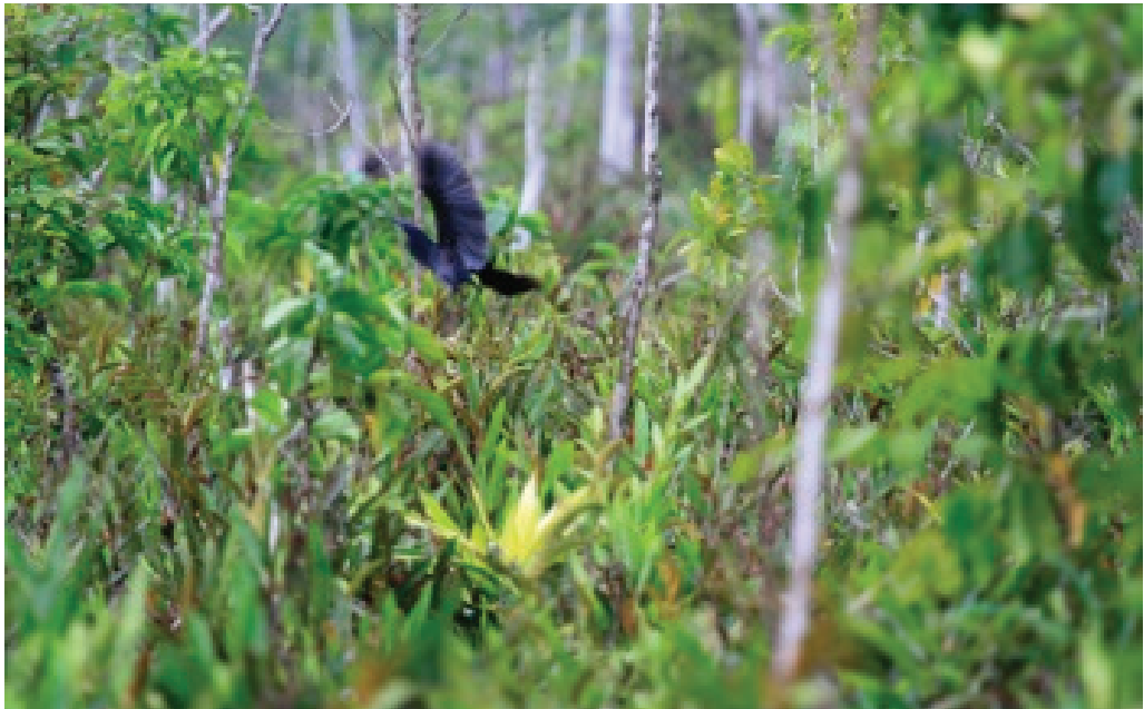
Figure 6. Melanistic Black Bittern Ixobrychus flavicollis , Biak, October 2012

(Fig. 6) in the tsunami swamp (F. Antram, eBird checklist S98647576); 5 August 2018: one at the same site (S. Lorenz, eBird checklist S47661085). KDB in Beehler & Pratt (2016) was incorrect to assert that there is at least one specimen from Biak.