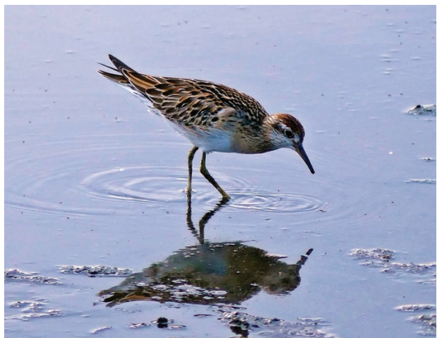
Figure 9. Sharp-tailed Sandpiper Calidris acuminata , Biak, November 2017

Status Palearctic migrant. Common passage migrant in New Guinea (Bishop 2006). Recorded