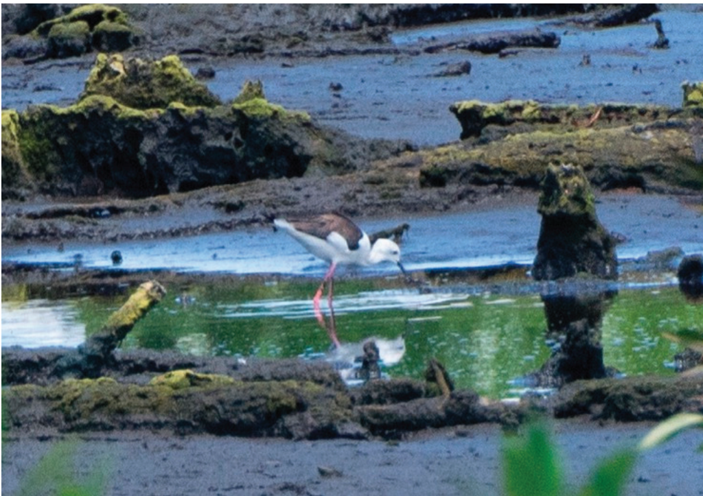
Figure 8. Black-winged Stilt Himantopus himantopus , Biak, 24 September 2019

Status Vagrant. First documented record for Australasia (Beehler & Pratt 2016, Menkhorst et al. 2017). 24 September 2019: an adult male (all-white head) first seen by D. Ashdown and photographed by P. Lansley (Fig. 8), feeding on mudflats in the tsunami swamp. It lacked the black on nape of adult Pied Stilt H. leucocephalus or browner wings with pale fringes to the primaries and coverts of young Pied Stilt, which do have white heads. It lacked the broad white mantle and back of Banded Stilt Cladorhynchus leucocephalus (P. Lansley, eBird checklist S64696799). Widespread throughout the Old World, Black-winged Stilt winters east and south to Borneo (Eaton et al. 2021) and the Philippines (Dickinson et al. 1991).