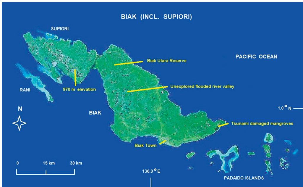
Figure 2. Biak showing locations mentioned in the text.

around Marauw (or Marao) in the south-east, and Sansundi in the north. He also made brief visits to southern and western Biak on 12–13 and 23 October 1997 and 25–26 April 2007.