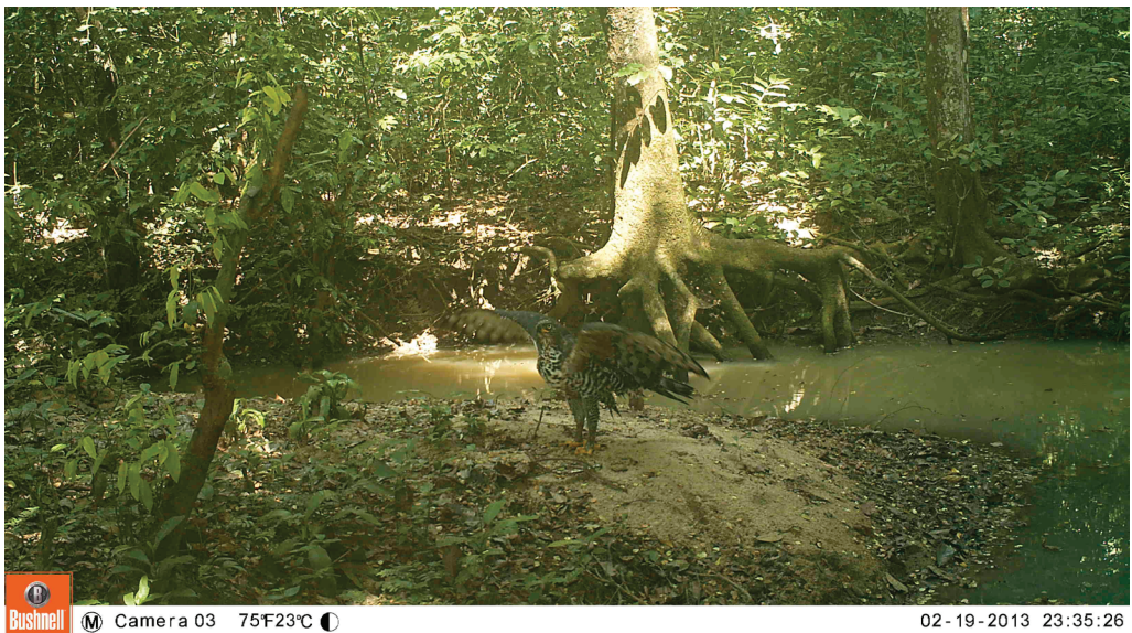
Figure 2. Camera trap voucher images of Long-tailed Hawk Urotriorchis macrourus (24 April 2015, above) and Crowned Eagle Stephanoaetus coronatus (19 February 2013, below) from Bire Kpatuos and Bangangai Game Reserves, respectively, South Sudan.