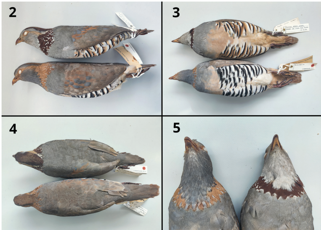
Figures 2–5. (Upper/right) male Barbary Partridge Alectoris barbara barbara , NHMUK 1965.M.1902, (lower/left) male Cyrenaica Partridge A. [b.] barbata NHMUK 1965.M.1904