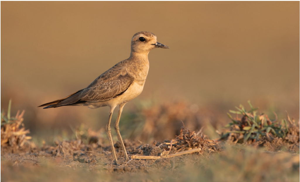
Figure 3. Caspian Plover Charadrius asiaticus , Gorongosa National Park, Mozambique, 23 October 2016; the first documented country record

2013; Brooks & Ryan 2024). A flock of 36 at Gorongosa National Park on 17 October 2016 (Z. Pohlen & C. Gesmundo in litt. 2016; S33982187; Fig. 3) was the first record supported by a photograph and was followed by a series of observations, mostly of 1–2 birds, until 16 November 2016. Finally, one at Macaneta on 4–25 February 2024 (JH & S. Jones, S160628994, T. & A. M. Moore, S161197293, JH, S162839291).