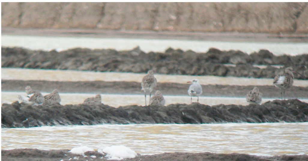
Figure 8. Seven Eurasian Curlews Numenius arquata , Salinas Zacharia, Mozambique, 12 January 2012, including at least two birds with strong supercilia and crown-stripes, and the bird on left also has white uppertail-coverts, features thought to be characteristic of N. a. suschkini (Gary Allport)

Birds from the eastern and western subspecies are visually distinct morphologically. Nominate arquata and suschkini are smaller than orientalis with less sexual dimorphism in size; arquata usually has barred axillaries and a dark-streaked lower rump and uppertail-coverts, whereas suschkini has white axillaries and a paler uppertail (Engelmoer & Roselaar