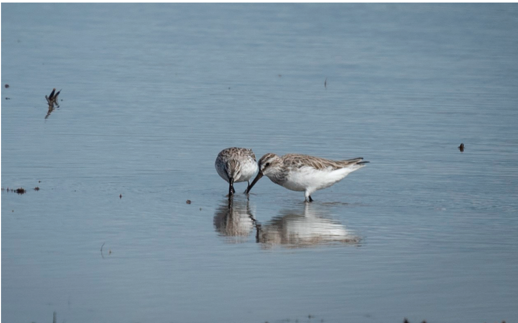
Figure 6. Broad-billed Sandpipers Calidris falcinellus , Lagoa Muangane, San Sebastian, Inhambane, Mozambique, 4 March 2022; the first documented country record

A vagrant in southern Africa with 34 records in September–February up to 1984, with most bird/months in January (Hockey et al. 1986). Records were on the west coast, notably Namibia and Langebaan Lagoon, and in the east, with a cluster of 16 records at Richards Bay, KwaZulu-Natal. The historical reports in Mozambique established the notion that Broad-billed Sandpiper occurs regularly in the country and the most recent specialist work