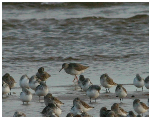
Figure 7. Common Redshank Tringa totanus , Ponta da Barra, Inhambane, Mozambique, 19 April 2008; the first documented country record

Subsequently, recorded as follows: singles at Ilha do Bazaruto on 4 November 1997 (K. Groenendijk, S1766796), Maputo on 12 March 2006 (R. Grey in Hockey et al. 2005 and Bull. Afr. Bird Cl. 14: 101), Barra on 19 April 2008 (M. Booyesen in litt. 2021; the first to be documented, see Fig. 7), Panda/Chacane Wetlands on 5 November 2009 (M. Booyesen in litt. 2021, T. Hardaker in Bull. Afr. Bird Cl. 17: 121) and San Sebastian