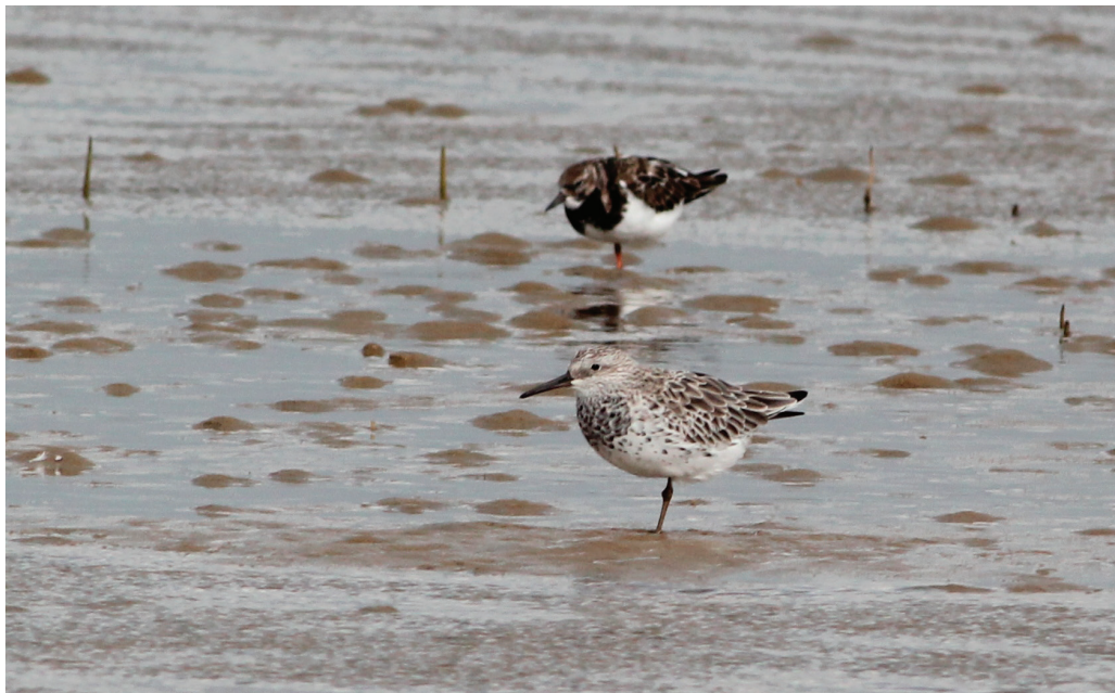
Figure 5. One of two Great Knots Calidris tenuirostris , Ponta da Barra, Mozambique, 6 March 2015