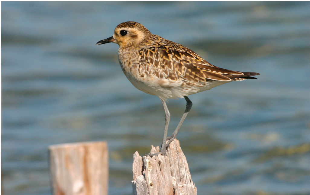
Figure 2. First-year Pacific Golden Plover Pluvialis fulva , Ponta da Barra, Inhambane, Mozambique, 21 October 2007; note short primary projection and longer tertials, which distinguish it from American Golden Plover P. dominica ; first documented record for Mozambique

No records mentioned for southern Mozambique by Parker (1999), however an observation at Ilha dos Portugueses off Ilha da Inhaca, in February 1987 was mentioned in Parker (2005) but no details were given by the observers (Nilsson & Shubin 1998).