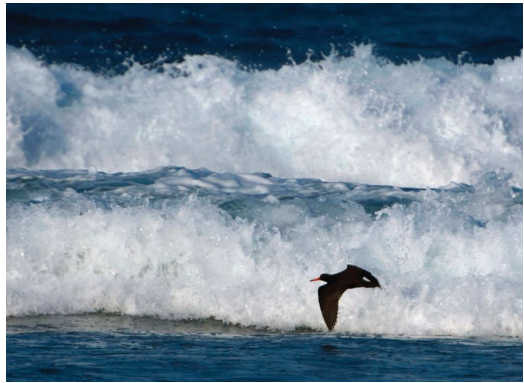
Figure 1. African Oystercatcher Haematopus moquini at Ponta Malongane on 13 June 2014, the first documented record of the species in Mozambique (© A. Joubert)

Further records are thus more likely in Mozambique.