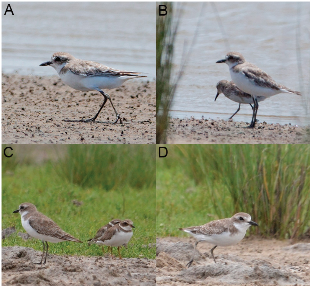
Figure 2. Greater Sand Plover Anarhynchus leschenaultii , Parque Nacional da Lagoa do Peixe, Rio Grande do Sul, Brazil, December 2015, with a White-rumped Sandpiper Calidris fuscicollis in B and two Semipalmated Plovers Charadrius semipalmatus in C