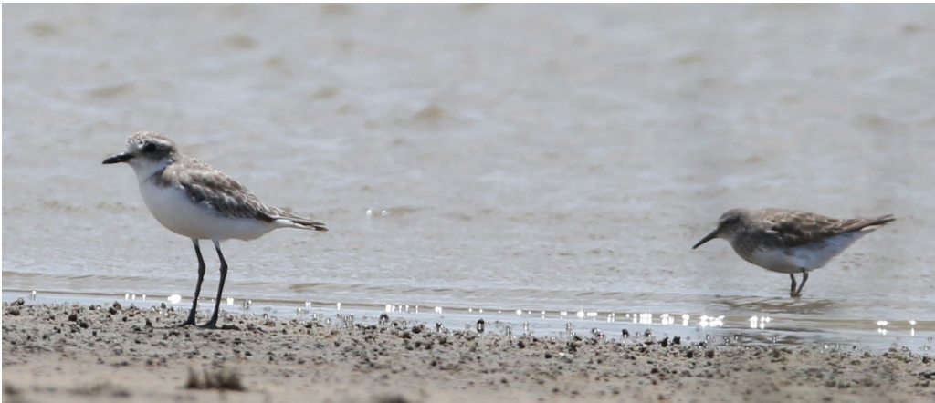
Figure 4. Greater Sand Plover Anarhynchus leschenaultii , Parque Nacional da Lagoa do Peixe, Rio Grande do Sul, Brazil, December 2015, with White-rumped Sandpiper Calidris fuscicollis on right; same individual as in Fig. 2 (André Luíz Fraga Briso)

Common Redshank Tringa totanus and Lesser Black-backed Gull Larus fuscus (Pacheco et al. 2021).