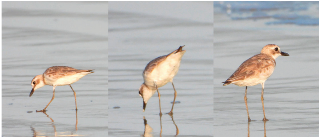
Figure 3. Greater Sand Plover Anarhynchus leschenaultii , municipality of Bertiooga, São Paulo, Brazil, 17 September 2023