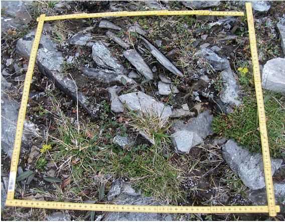
Figure 2. The 0.25-m 2 field plot with Campylium longicuspis on Mt Pältsa in northernmost Sweden.