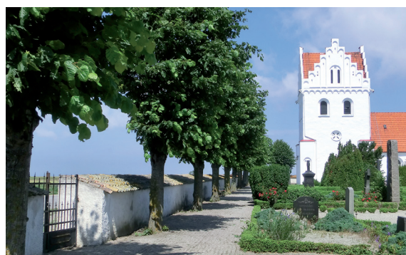
Figure 5. The largest bark population found, with approximately 200 thalli growing on bark of 22 Tilia sp. trees. The surrounding wall population is also very large (Table 1) (Skegrie church).

Our results support the hypothesis that establishment on trees are dependent of wall populations in close vicinity, continuously bombarding the suboptimal tree habitats with diaspores. The Mölleberga churchyard locality, where the churchyard wall has recently been whitewashed and the wall population are now without X. calcicola