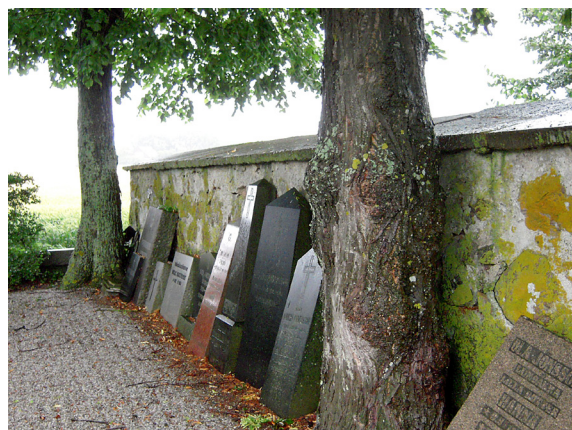
Figure 3. Two trees ( Tilia sp.) with X. calcicola growing close to the churchyard wall with a large X. calcicola population (Hofterup church).

we have observed ca 300 thalli of X. calcicola growing on bark. At six of the previously known localities, including one where it was reported relatively recently (Malmqvist 2000), the species was not found (Table 1). At all localities except one X. calcicola in addition to bark was present on the surrounding churchyard walls. The only exception was Mölleberga churchyard (Fig. 4B), where there were virtually no lichens on the wall, indicating that it had been recently whitewashed (Lindblom and Blom 2010). The wall populations at localities where X. calcicola grows on bark were, on average, larger than other wall populations ( 1706 \pm 2559 versus 489 \pm 1360 thalli), and a larger proportion of them possessed thalli with apothecia (71.4% versus 50.5%). Thus, localities with tree populations seem to have important source populations on walls in relation to localities with populations on walls only. Seemingly suitable churchyard trees were present at most of the investigated localities, indicating that colonization of X. calcicola on trees is a rare event. The trees harbouring X. calcicola were always growing close to the wall habitat, up to \leq 5 m (Fig. 3). These results add to the hypothesis that trees are actually suboptimal habitats for X. calcicola . Hence, bark populations are sinks (sensu Dias 1996) sustained by continuous supply of diaspores from the connected source population on walls (sensu Dias 1996).