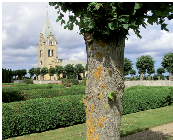
Figure 2. Epiphytic population consisting of one single thallus of X. calcicola on a Tilia sp. (Östra Nöbbelöv church).

The populations found on bark vary in size from 1 to ca 200 thalli (Fig. 2–5). All bark populations are small (1–24 thalli), except one (Skegrie churchyard, Fig. 5). Two are rediscoveries at localities where it has previously been collected on bark and 12 are new discoveries. In total,