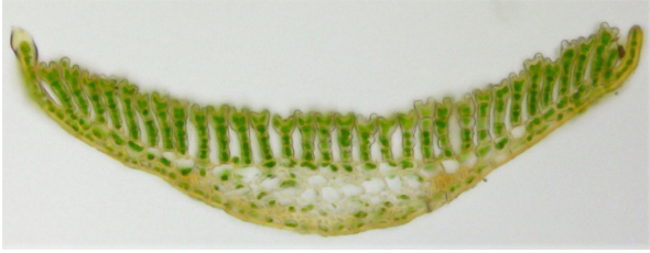
Figure 1. A leaf cross section showing the leaf anatomy of Polytrichaceae with lamellae and the forked terminal cells, which are diagnostic for Polytrichum commune . This section is the best result out of three trials with the magnetic sectioning aid by someone who had never sectioned a bryophyte before. In all three trials, sections with clearly recognisable diagnostic features were present.

Application of the method is demonstrated in an instructional video in the supplementary material, which may help to harness the magnetic aid for teaching and personal use. Sectioning starts with the positioning of a standard microscope slide on the support plate in the area between the six central tongues. This prevents the slide from gliding away during sectioning and correctly aligns it with the lateral non-magnetic strip. On this lower slide, a