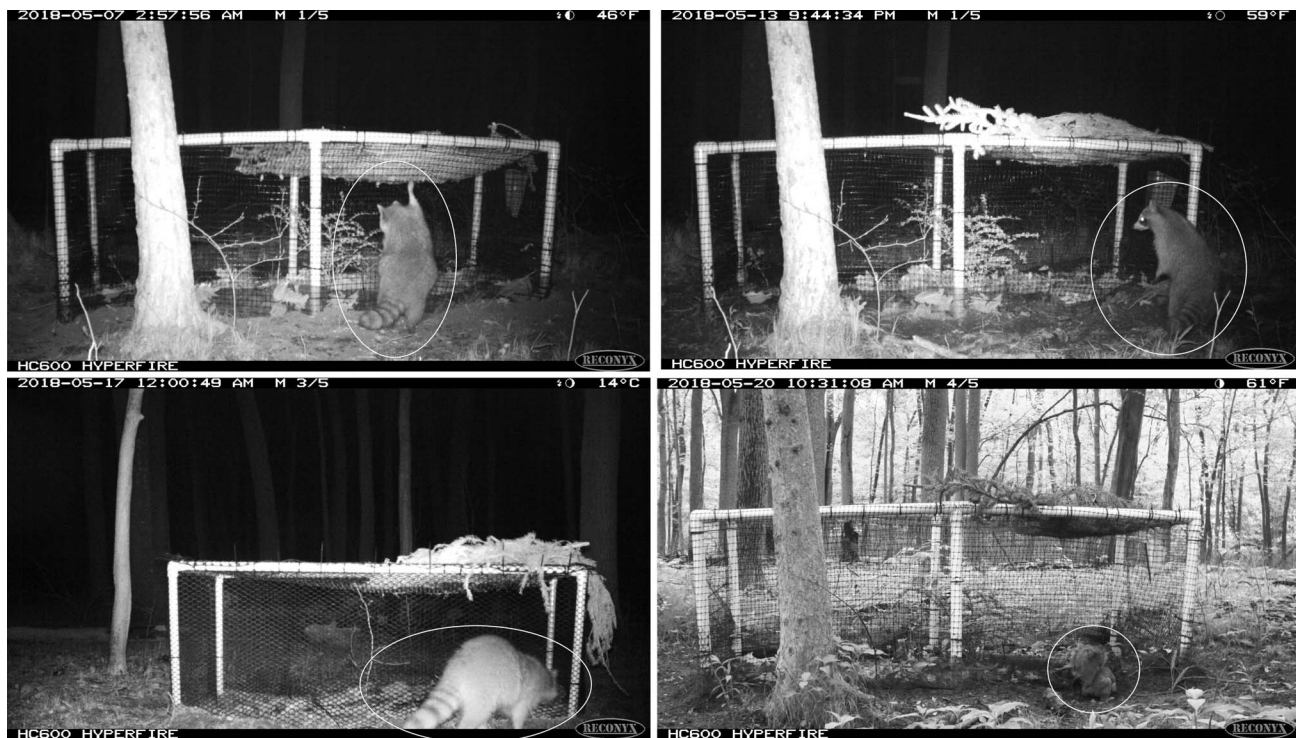
Figure 1. Visits by predators (circled) to acclimation pens containing juvenile eastern box turtles ( Terrapene carolina ) at Fort Custer Training Center, Michigan, USA, documented with motion-triggered cameras. Counter-clockwise from top right: raccoons ( Procyon lotor ) in the first three images and fox squirrel ( Sciurus niger ) in the fourth image.

were buried approximately 10 cm into the ground to keep predators from entering and prevent turtles escaping. Four turtles were placed in each pen. We provided fresh water daily in a shallow ceramic dish within each pen. Further details of study animal acquisition, husbandry methods, and the acclimation penning procedure are described elsewhere (Tetzlaff et al. 2019b).