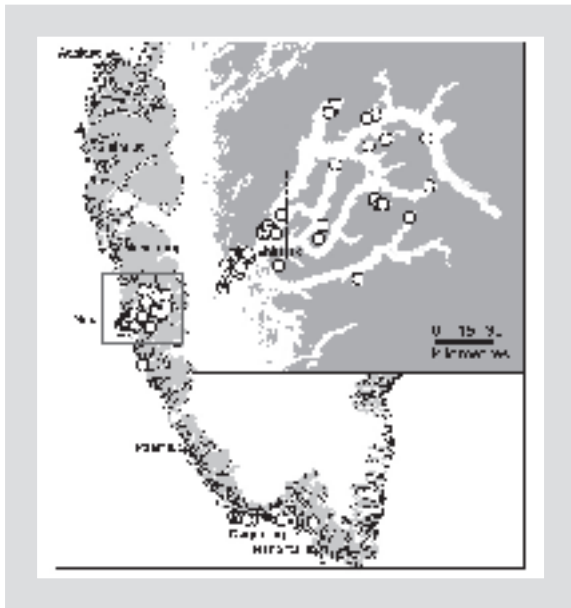
Figure 1. Areas of West Greenland where common eider (○) or king eiders (▲) were collected during 2000, 2001 and 2002; on the insert showing the Nuuk region, the border between the coast and fjord habitat is marked (---).