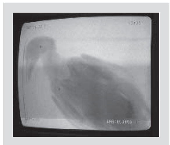
Figure 2. Standard airport security X-ray equipment was used to identify embedded shot. This common eider carries one pellet in the head and one in the breast muscle.

A total of 993 birds, i.e. 879 common and 114 king eiders, were examined for embedded lead shot by either passing them (N = 764 birds) through an airport security check X-ray device (Schlumberger Controlix 2E) at Nuuk Airport with parallel colour and B/W monitors connected, or by taking high resolution X-ray photographs (35 × 40 cm) at the local hospital in Nuuk (N = 229). The first method was applied to most drowned birds, whereas the latter method was used to safely distinguish between embedded shot and the larger pellets used to collect some samples. To verify the ability of the airport X-ray equipment to detect pellets, a sample of 10 birds with lead shot was inspected using both methods. The number of pellets in each carrier was counted, and in case more than one size of lead pellets could be identified (disregarding the large pellets used in sampling some of the birds) the number of each pellet size was recorded. For the wounded birds, notes were taken on the approximate position of the pellet(s), i.e. in the body, head, wings, legs or rump (Fig. 2).