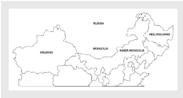
Figure 1. The wolverine distribution in China is separated into an western subpopulation with uncertain distribution (shown by the question mark) and a eastern subpopulation with known distribution (shown by dots).

clining or disappearing wolverine populations in most states of the USA (Nowak & Paradiso 1991). Wolverine populations also declined in Scandinavia and Russia during the last century (Landa et al. 2000).