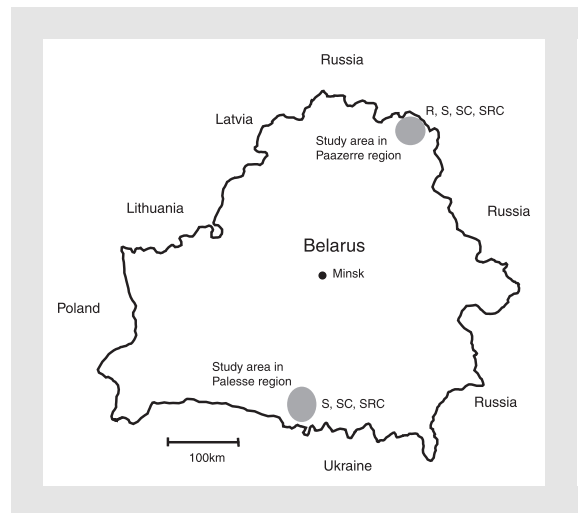
Figure 1. Location of our study area in Belarus with indication of the study methods used: R = radio-tracking, S = snow-tracking, SC = scat collection, and SRC = small rodent census.

Paazerre, a hilly area originating from the last glaciation (Matveev et al. 1988), is part of the extended region of the European forest zone and has intermediate conditions between the more southern deciduous (mostly broad-leaved) forests and the boreal coniferous forests. Spruce Picea abies and pine Pinus sylvestris are dominant coniferous trees, and small-leaved trees (black alder Alnus glutinosa and birches Betula pendula , B. pubescens ) are the most common deciduous trees. Paazerre is also characterised by an extensive aquatic network (mean density of rivers being 0.7 km/km 2 ; numerous small and medium-sized residual glacial lakes ranging in size within 0.3-2 km 2 ). Open grassy marshes do not account for a large portion of the territory and are most common in valleys of rivers and glacial lakes. The study was carried out in a 300-km 2 area located in the Gorodok district (see Fig. 1; habitat composition of the study area is given in Table 1). The cold season in Paazerre, defined as the season with snow cover and average air temperature usually dropping below 0°C, normally lasts from early November until early April. Most winters are quite