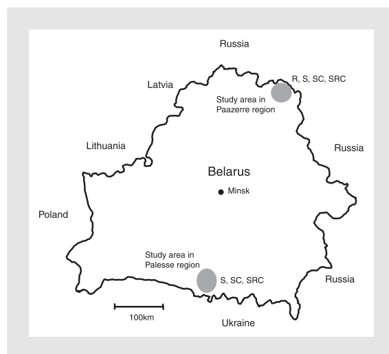
Figure 1. Location of our study area in Belarus with indication of the study methods used: R = radio-tracking, S = snow-tracking, SC = scat collection, and SRC = small rodent census.

Paazerre, a hilly area originating from the last glaciation (Matveev et al. 1988), is part of the extended region of the European forest zone and has intermediate conditions between the more southern deciduous (mostly broad-leaved) forests and the boreal coniferous forests. Spruce Picea abies and pine Pinus sylvestris are dominant coniferous trees, and small-leaved trees (black alder Alnus glutinosa and birches Betula pendula , B. pubescens ) are the most common deciduous trees. Paazerre is also characterised by an extensive aquatic network (mean density of rivers being 0.7 km/km 2 ; numerous small and medium-sized residual glacial lakes ranging in size within 0.3-2 km 2 ). Open grassy marshes do not account for a large portion of the territory and are most common in valleys of rivers and glacial lakes. The study was carried out in a 300-km 2 area located in the Gorodok district (see Fig. 1; habitat composition of the study area is given in Table 1). The cold season in Paazerre, defined as the season with snow cover and average air temperature usually dropping below 0°C, normally lasts from early November until early April. Most winters are quite