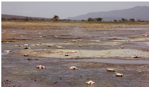
Figure 1. Flamingo die-off at the shore of Lake Bogoria in July 2008. Within one week, about 30 000 out of 150 000 flamingos died.

(Nakuru) and Ramsar site (Bogoria). The surface area of L. Nakuru (00°S, 36°E; 1756 m a.s.l.) between 36 and 49 km 2 depends on precipitation, evaporation and human use such as irrigation and varies highly throughout the year. The lake has a maximum depth of about 1 m and is daily mixed. The surface area of L. Bogoria (00°N, 36°E; 990 m a.s.l.) is usually about 34 km 2 , but extending during distinct rainy seasons especially in the northern area. With a maximum depth of 10.2 m (Hickley et al. 2003), it is stratified over longer periods (McCall 2010).