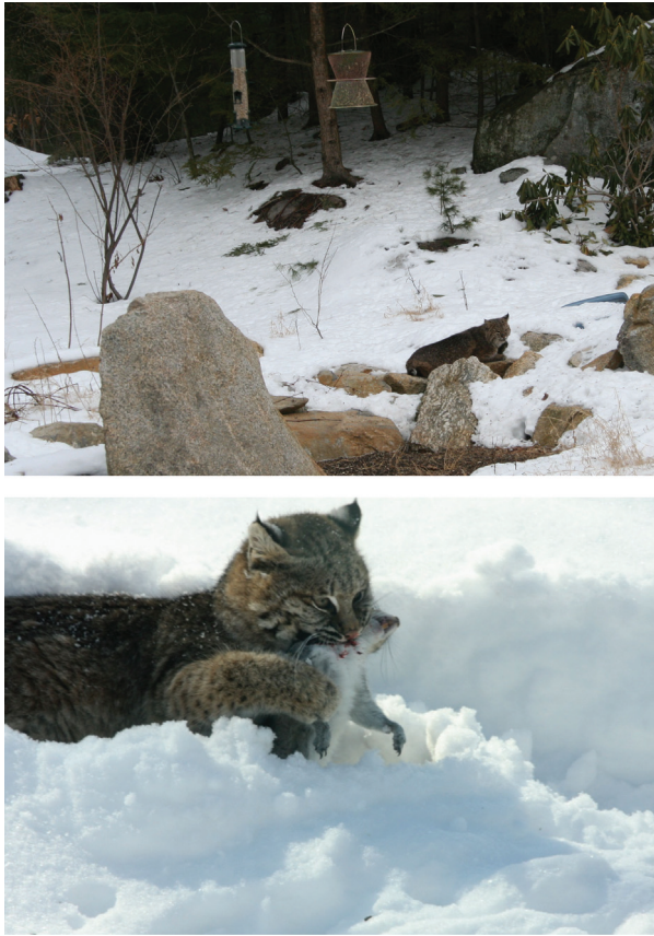
Figure 2. Photographs of bobcats in suburban New Hampshire backyards. Top: a bobcat is loafing underneath two bird feeders. Bottom: a juvenile bobcat has just captured a gray squirrel that was attempting to forage at a bird feeder.

to substantially reduce the biases associated with these data after they were collected.