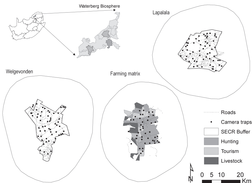
Figure 1. Location of the study sites within the Waterberg Biosphere, South Africa and camera locations within each study site as well as the buffer used in the spatially explicit mark recapture models. Shaded areas in the farming matrix indicated the different land use types.

We followed camera trapping protocols for closed population mark recapture studies on large carnivores (Karanth and Nichols 2002). Camera traps were set out in pairs in a grid with a cell size of 6.25 km 2 , which corresponds to approximately half the smallest home range diameter for leopards in mountainous areas (10 km 2 ; Smith 1978). This resulted