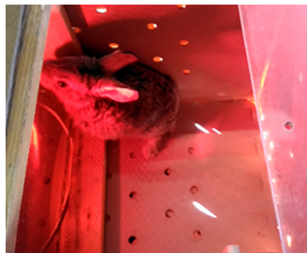
Figure 2. Recovery of body temperature in a box with infrared light heating regulated by thermostat.

fence. Extreme outliers were only found in the temperature measurement and were not removed due to small sample size and clustering. Values biologically non-logical (e.g. heart or