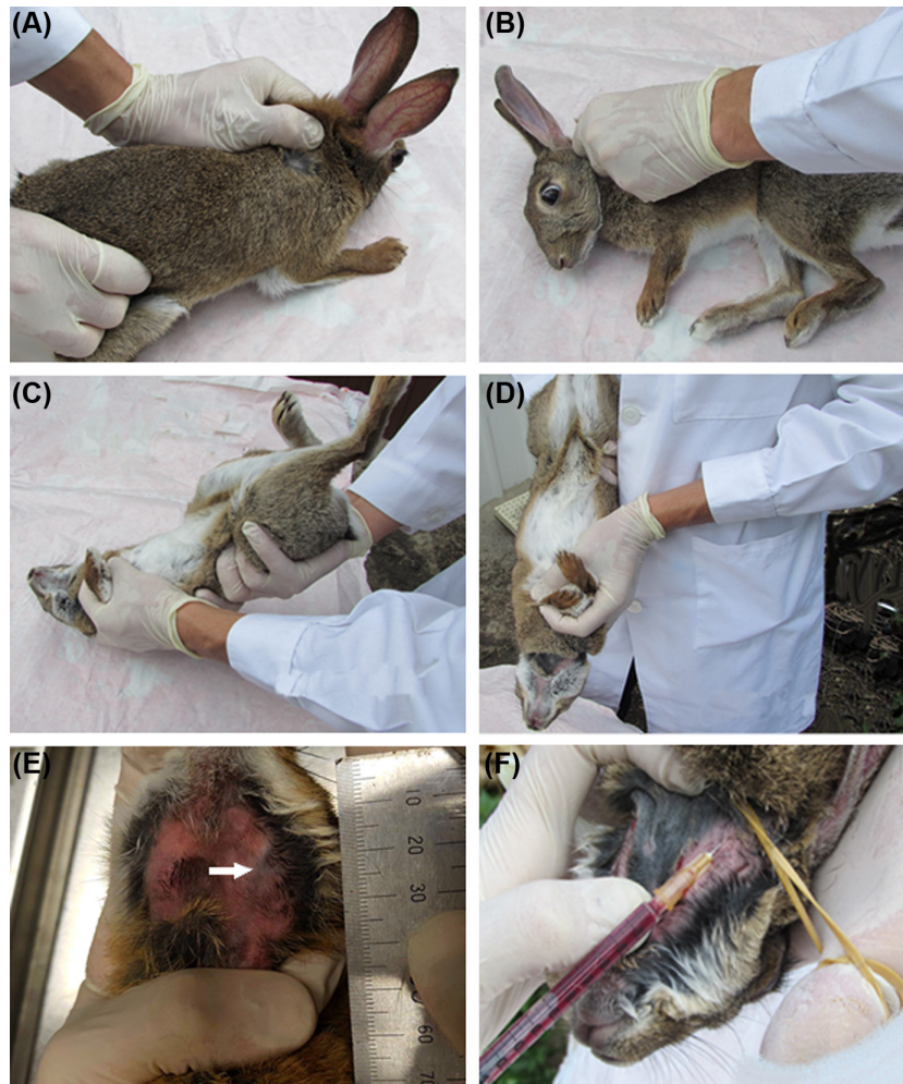
Figure 1. Sequence of procedures for containment and presentation of the animal for blood collection. First approach (A), lateral decubitus (B), dorsal decubitus (C), presentation of the animal for blood collection (D), visualization of external jugular vein (E) and blood collection (F). The arrow indicates the beginning of the external jugular vein. Cranially at this point are the linguofacial and retromandibular veins.

During handling, a small ear biopsy was obtained from a subset of the captured rabbits ( n = 12 ) and kept in 96% ethanol until further analysis. Additionally, samples from five domestic rabbits were obtained for comparative purposes. Genomic DNA was extracted using the EZNA DNA purification kit (Omega) following the manufacturer's guidelines. Two molecular markers were amplified via PCR to infer the taxonomic status of the analysed rabbits: the mitochondrial control region and the first intron of the coagulation factor IX (F9) gene (X chromosome). Obtained sequences were compared with those published in public databases for subspecies inference. The details of the protocol are not revealed in this study because they are not within its scope.