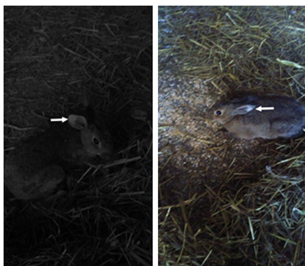
Figure 4. Photographs taken after release of the rabbits. Left- at night (arrow indicates the marking on the ear); right-during the day (arrow indicates the marking on the ear).

From our experience, restraint of the animal by an experienced person and correct identification and visualization of the EJV proved critical to guarantee the success of the procedure, in the first attempt. Presenting the animal correctly to the person in charge of the venepuncture was essential for visualization and less deviation of the EJV, located laterally to the midline and overlying the internal jugular vein and the carotid artery. Shaving the neck over the midtrachea cranial to the thoracic inlet (Quesenberry and Carpenter 2012) can be carried out for a better EJV visualization. If shaving must be performed, electric hair clippers with thin blades