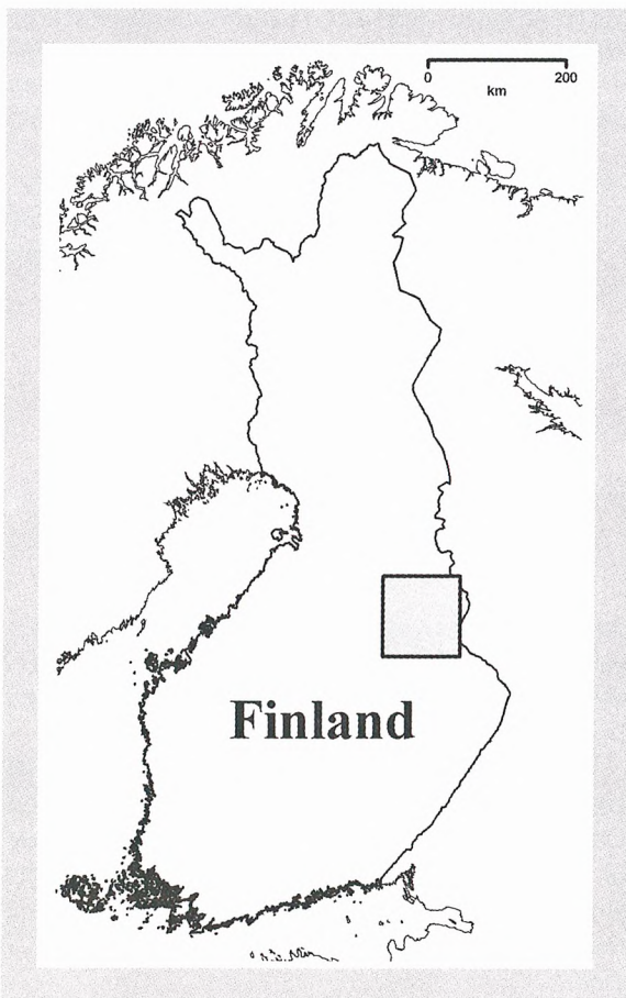
Figure 1. Location of the study area in east-central Finland where six wolf territories were examined during 1999-2001.

We performed our study in east-central Finland (Fig. 1) during 1999-2001. The study area is mostly comprised of exploited coniferous forests dominated by Scots