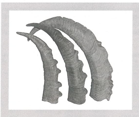
Figure 2. Right horns of three males in their fourth year of life from Bregaglia (Grisons, Switzerland). From left to right: a pure Alpine ibex ( Capra i. ibex ), an F2 and an F1 hybrid Alpine ibex x domestic goat hybrid, respectively.