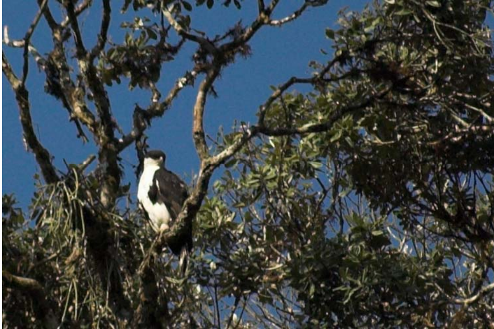
Figure 2. An adult Cassin's hawk-eagle Spizaetus africanus , photographed in Ndundulu Forest, Tanzania, August 2006.

Rüppell, 1836. Single birds were spotted on two occasions sitting in the tall upper canopy of the forest (which reaches over 50 m in height), and on three occasions soaring in circles low over the forest canopy. On two occasions a bird was heard calling while in flight, a short high-pitched call repeated several times, which was later recorded and compared with and noted to sound identical to an audio recording of Cassin's hawk-eagle. It is not possible to confirm whether all encounters have been with the same or different individuals.