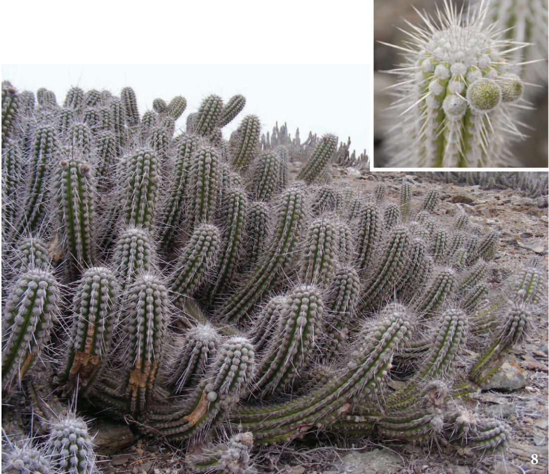
8 The sprawling stems are only found in the genus for E. chorosensis and E. castanea , which grows farther south, from Los Molles to Tongoy. Picture taken on 5 November 2007, on Isla Chañaral, just south of the Llanos de Choros, and part of the Humboldt Penguin National Reserve. Inset The large felted areoles and the 'more bristly than E. acida - less woolly than E. breviflora or E. iquiquensis ' buds.

and numerous filling the whole of the open flower. Anthers light yellow. Fruit globular, about 5cm in diameter, initially green turning brownish-green at maturity and retaining scales and dark brown wool. Pulp translucent white and acidic, containing numerous seeds. Fruit wall thick with large cells containing colourless mucilage. Seeds about 2 mm long, 1.2 mm wide, 0.5 mm thick, black-brown, matt.