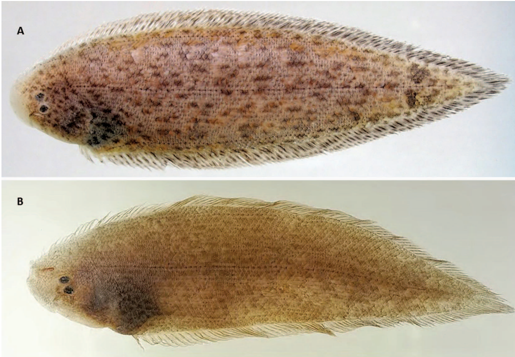
Fig. 2. Comparison of color patterns and body shapes between Cynoglossus nanhaiensis , new species, and C. maccullochi (CSIRO H6548-01) taken off Queensland, Australia. (Photograph of C. maccullochi provided by D. Gledhill, CSIRO).

mm SL; 01 May 2011. SCF2011196; female, 115.5 mm SL; 01 May 2011. SCF2011197; male, 123.2 mm SL; 01 May 2011. SCF2011187; female, 120.1 mm SL; 01 May 2011. SCF2011199; female, 109.2 mm SL; 01 May 2011. SCF2011200; female 105.7 mm SL; 01 May 2011. SCF2011186; female, 129.0 mm SL; 01 May 2011. SCF2011188; female, 120.2 mm SL; 03 Jan 2010. SCF2011205; male, 122.8 mm SL; 24 Nov 2011. SCF2011206; male, 127.1 mm SL; 24 Nov 2011. SCF2011207; male, 143.2 mm SL; 24 Nov 2011. SCF2011209; male, 131.5 mm SL; 24 Nov 2011. SCF2011210; male, 126.0 mm SL; 24 Nov 2011. SCF2011211; male, 121.9 mm SL; 24 Nov 2011. SCF2011212; male, 115.1 mm SL; 24 Nov 2011. SCF2011213; female, 128.1 mm SL; 24 Nov 2011. SCF2011214; male, 133.8 mm