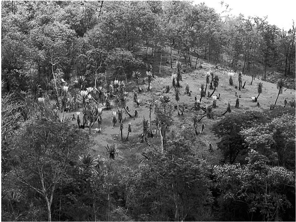
FIGURE 2.—Seven- to nine-meter tiusintes survive in a recently-cleared pasture on the ecotone between gallery forest along the Quebrada de los Hornos (Saguay, Gualaco), and deciduous tropical broadleaf forest upslope. This figure illustrates an early stage in conversion from finca to pasture; Figure 3 shows a later stage.

populations and users. The intent of the 2003 expedition was to visit as many wild populations as possible within the time frame allotted and to gather plant materials for a variety of scientific purposes (see Haynes and Bonta 2003; vouchers were deposited at TEFH). Ethnobotanical data were gathered using the methods described in the following sections.