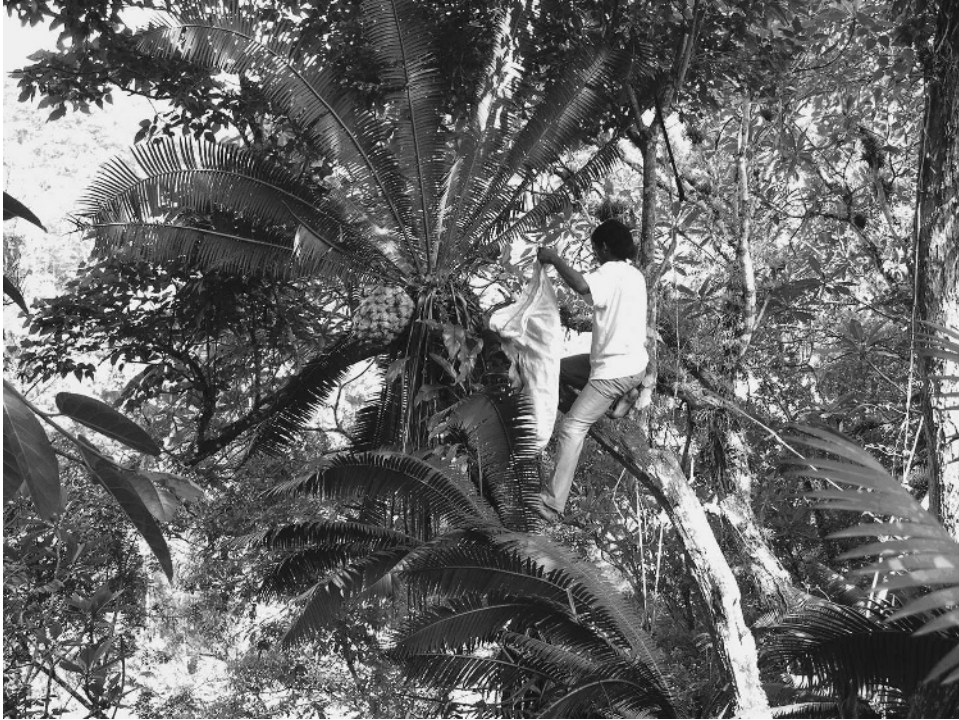
FIGURE 5.— Tiusintero in Río de Oro, Gualaco, preparing to harvest a large cone from a tiusinte overhanging a precipice.

tiusinte could be “stretched,” combined with other foods to tide the family through until the first maize harvest, which in some cases could be as late as September.