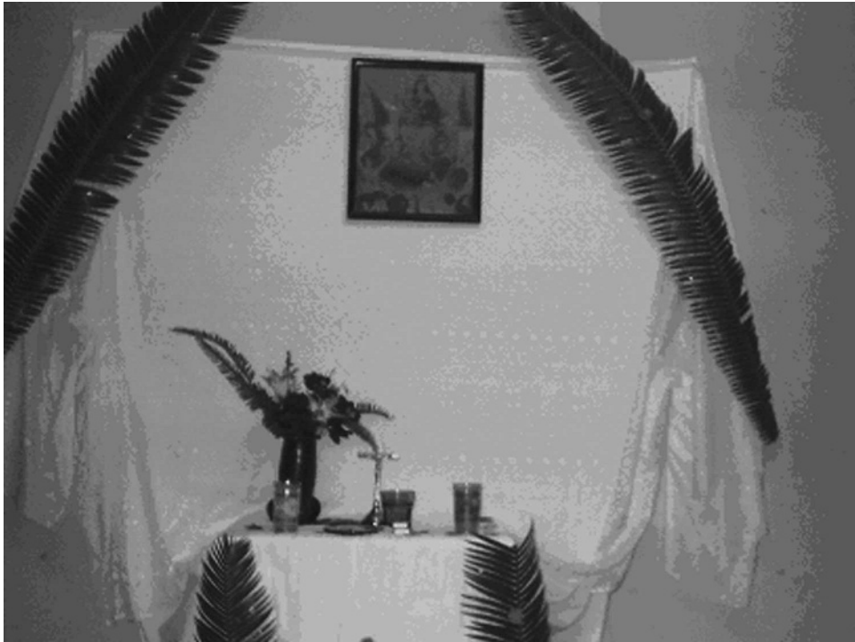
FIGURE 10.— Pencas de tiusinte ( Dioon mejiae ) in a household altar in Juticalpa, Olancho.

and partly with the Christmas season. Nativity scenes in Esquipulas del Norte contain tiusinte leaves. In Olanchito, the tiusinte leaf is associated primarily with the 24 th of December and minimally with death (e.g., tiusintes once grew next to gravestones in the public cemetery).