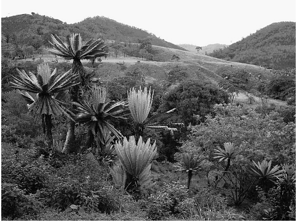
FIGURE 4.—Remnant of the Saguay, Gualaco tiusintal , referred to locally as the finca . Tall tree in left foreground is seven meters in height; lighter-colored leaves are the present year's flush ( vestimento ). Middleground habitat is dense gallery forest along the Quebrada de los Hornos; slopes in the background are cloaked in pasture and tropical deciduous broadleaf forest and scrub. Altitude 600 m above sea level.

we did not conduct research during the days when tiusinte use is most prevalent (e.g., Semana Santa [Easter Week], Día de los Muertos [All Souls' Day], Noche Buena [Christmas Eve], and bishops' visits).