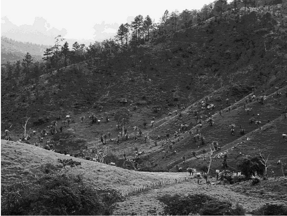
FIGURE 3.—Pasture with tuisintes in Saguay, Gualaco, along the Quebrada de los Hornos. Clearance of the tropical deciduous forest finca has taken place since 1990; tuisintes, respected as common-property resources, were not intentionally removed, and as hardy woody species, managed to survive repeated fires. Over time, however, serious degradation of the remaining tuisintes has occurred.

permission from interviewees to include video clips in a 2003 Spanish-language educational video that he produced (“El otro teocinte”); Bonta and Zúniga’s footage was used solely for research analysis.