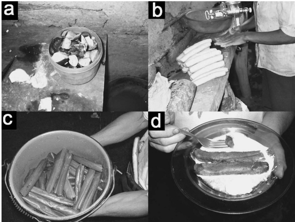
FIGURE 8.— Tamales de tiusinte : (a) chopped-up and cooked seeds; (b) shaped masa ; (c) wrapped in jucuyl leaves and cooked; (d) eaten with mantequilla .

Seeds for immediate consumption are split open (usually by girls) with rocks. The white, starchy kernels ( comida or producto ) are broken into small pieces as the second step in the preparation of all tiusinte food products. From that point on, however, techniques of preparation and types of products prepared vary from family to family, village to village, and municipality to municipality.