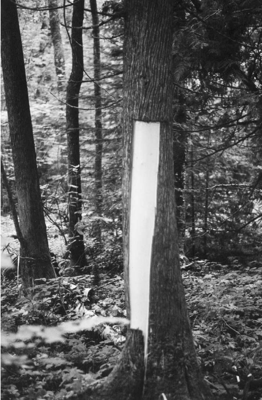
FIGURE 3.—Proper way to harvest cedar ( Thuja occidentalis ) so that the tree will survive.