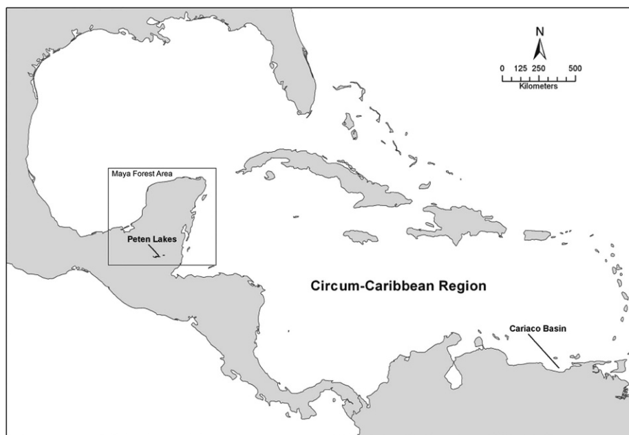
FIGURE 1. The Circum Caribbean Region and the Maya Forest Area with the location Cariaco Basin and Petén Lakes indicated.

devoted to milpa production remain under successional stages of forest cover (Finegan 2004; Zetina 2007). The ultimate result is a mosaic landscape dominated by woody species of economic importance to the lowland Maya. This is the Maya Forest garden.