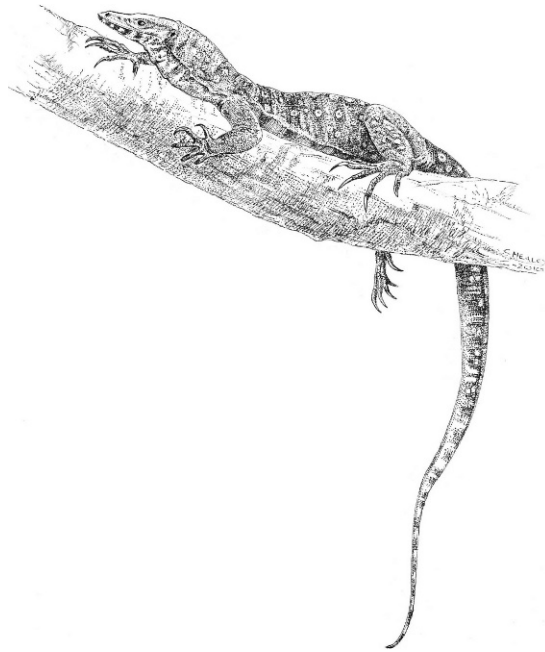
Figure 3. The water monitor, Varanus salvator . Illustration by Christopher Healey.

classification of large lizards and consider how these may illuminate local knowledge of V. komodoensis and the species' present or recent distribution.