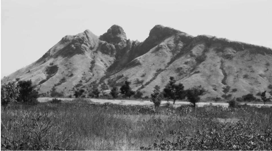
Figure 4. The twin-peaked Mount Sanga Benga in north central Flores.