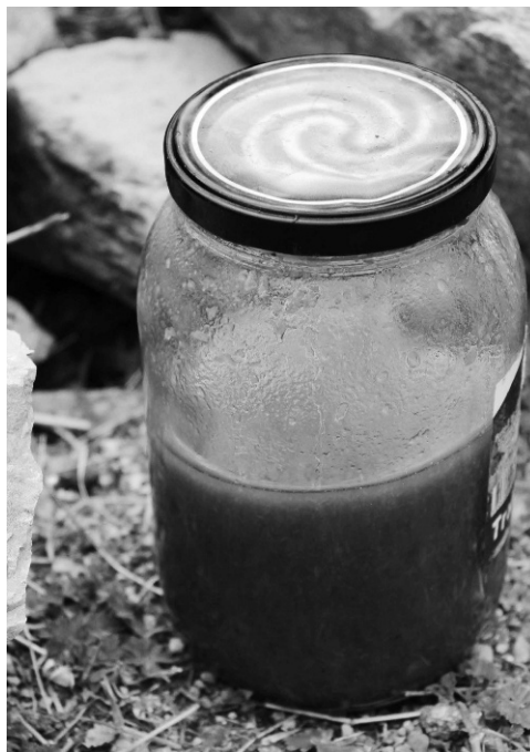
Figure 3. The fruits of Prunus spinosa L. are crushed, mixed with water, sealed in a large jar as depicted (ca. 30 cm wide, 60 cm tall) and left to ferment, eventually forming a gassy fruit soda that is filtered and drunk as a source of refreshment and for its general health boosting properties. Following the fermentation, the fruit soda is then strained and the liquid is typically transferred to empty 1 L plastic bottles (i.e., used Coca-Cola bottles) for storage and daily use.

of which are consumed for their refreshing quality and perceived health benefit (Figure 3). These beverages are created in an anaerobic environment (using sealed bottles) and sugar is sometimes added during the fermentation process to feed the culture and increase gas production (in the form of \text{CO}_2 ). The health benefits of these beverages are multifold, and the ease of preparation makes them a common household staple as a source of nutritious, potable beverages. Moreover, these non-alcoholic beverages are culturally appropriate for the Gorani as the use of alcoholic beverages is not permissible in the Islamic faith.