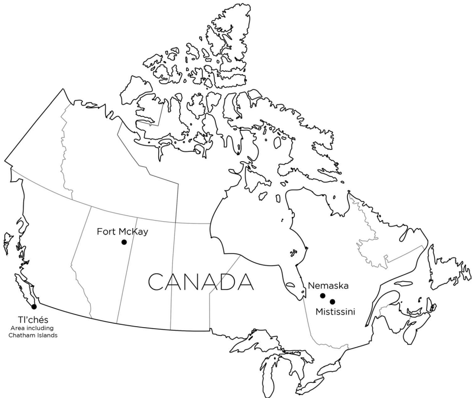
Figure 2. Map showing location of the three case examples from Canada of “Cultural Keystone Places.”

its original cover remaining (Lea 2006). Garry oak savannahs are part of a culturally maintained landscape, reflecting the ecological imprint of intensive Indigenous management practices, mainly through frequent low-intensity fires, over thousands of years, yielding an open landscape for hunting and increased production of camas ( Camassia quamash [Pursh] Greene, C. leichtlinii [Baker] S.Watson) and other edible geophytes (Anderson 2005; Beckwith 2004; Turner 1999). Tl'chés's Garry oak ecosystem is habitat for many native species, including red-listed California buttercup ( Ranunculus californicus Bentham), Macoun's meadow-foam ( Limnanthes macounii Trelease) and the endangered sharp-tailed snake ( Contia tenuis Baird & Girard), among others (COSEWIC 2009). Camas, a cultural keystone species for Coast Salish peoples of Vancouver Island (see Garibaldi and Turner 2004), survives on ancient, cultivated shallow soils in parts of Tl'chés , and has been the object of restoration studies recently (Beckwith 2004; Gomes 2012; Gomes 2013; Higgs 2003). Tl'chés encompasses numerous culturally significant areas such as heritage orchards, shell middens, culturally modified trees, and sacred sites; however, the archipelago's biocultural diversity is threatened by land use conflicts and invasive species (Gomes 2012).