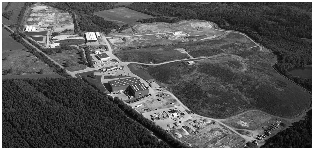
Figure 1. Aerial photo of Østdeponi/AFLD Easterholt 2 .

But more was afoot in this landscape of waste than human destruction and environmental exceptionalism. And to see this, we need to turn to its non-humans. For throughout this post-mining landscape of the 1970s, mycorrhizal fungal spores began forming symbiotic connections with the roots of lodgepole pines ( Pinus contorta ) (Gan and Tsing, this issue), imported from North America and given the name “dune