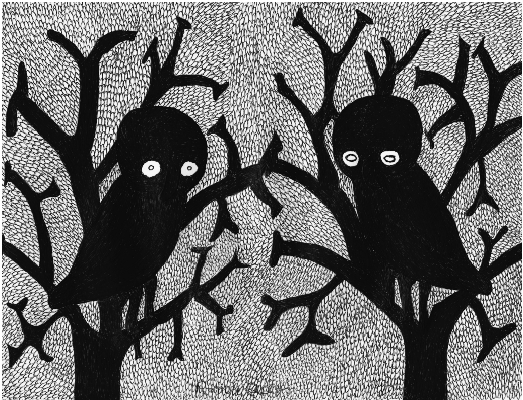
Figure 1. Prototypically “signifying” birds. Ballpoint pen on paper by Romero Cáceres, Chaco, Paraguay, c. 2014; from the collection of the first author.

sense or cultural concept/definition of the sign vehicle’s meaning (Saussure’s “signified”), and 3) the object or, in our case, outcome (Chandler 2002:34). For example, in England, an encounter with a Pica pica would be considered a sign when: 1) a magpie is 2) seen and if one fails to salute the bird one may 3) experience bad luck. Another example is when: 1) an akerrke (Western Bowerbird, Chlamydera guttata ) is 2) observed by Australian Arrente speakers near fig trees 3) they know to look for ripe fruit (Turpin et al. 2013:21). Our sign vehicles are material—vocalization, body presence, and action—in the sense of Voloshinov’s (1973:10–11) modifications of Saussurean semiotics. Given the robustness of cross-cultural use of birds as signs, we let this corpus define bird sign rather than delve deeply into a discussion