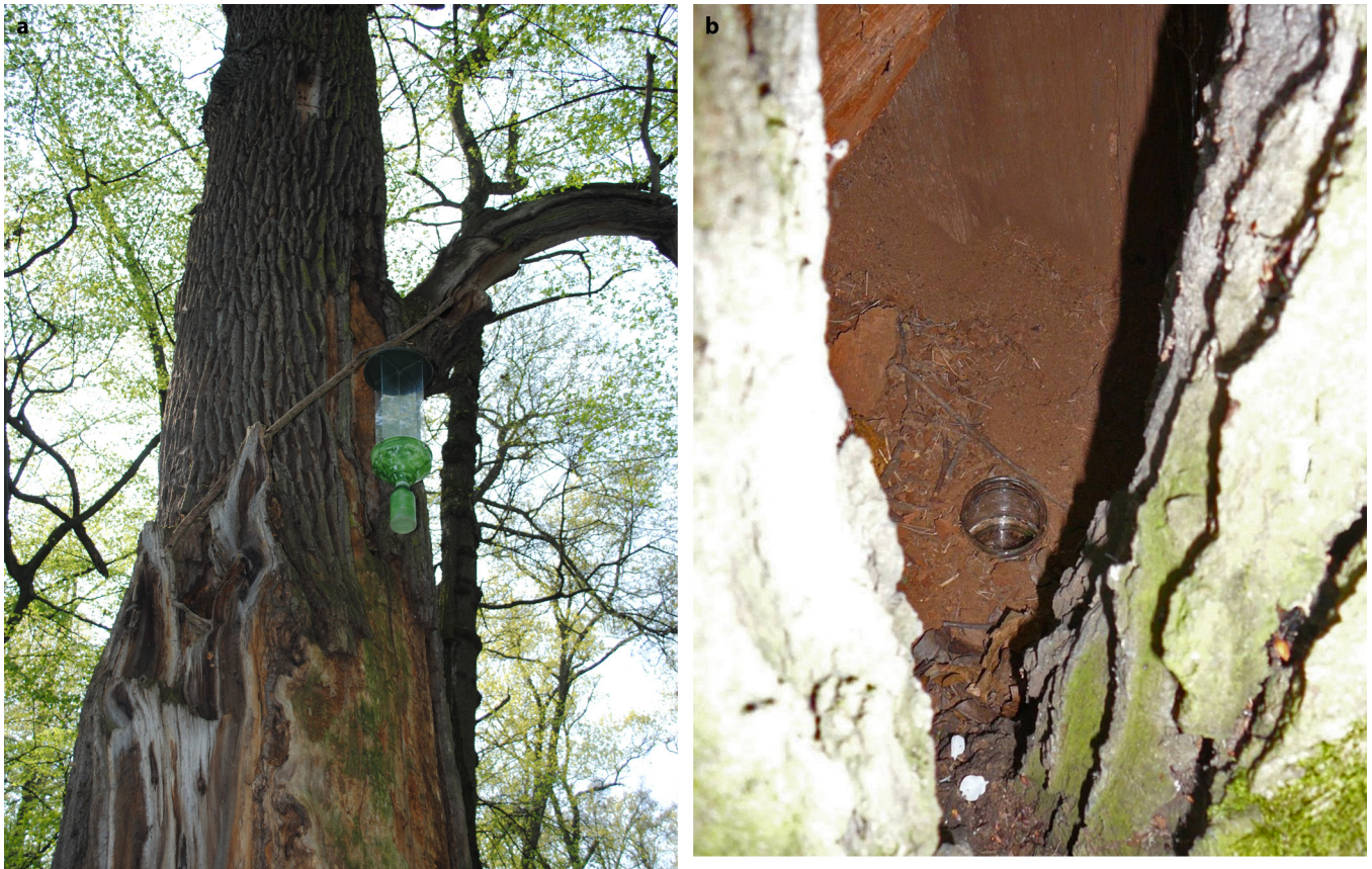
Fig. 2: Sampling methods used during the current study. a. Flight interception trap (FIT); b. Pitfall trap (PT) inside a tree hollow

identified only to family level (Tab. 1). Pitfall traps placed in tree hollows yielded 157 specimens belonging to 20 taxa and 11 families (Fig. 4a). The most abundant species trapped in the tree hollows were Tegenaria ferruginea (Panzer, 1804) and Midia midas (Simon, 1884). The most species-rich family in the pitfall traps was Linyphiidae with six species and a group of species identified only to family level. Most spiders collected in hollows are horizontal web builders. Seven spider taxa were obtained exclusively by pitfall traps. A total of