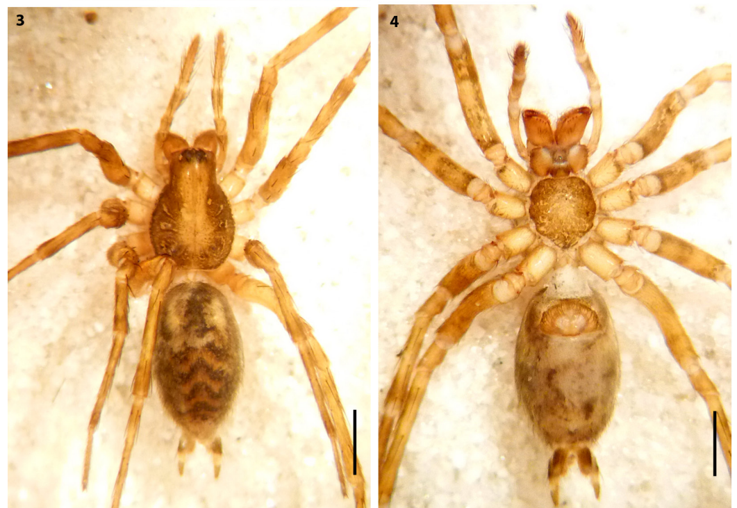
Figs 3–4: Histopona kurkai sp. n., female paratype, habitus, dorsal and ventral views, scales: 1.6 mm

a convex margin, being distinctly smaller than the outer, and the base of the whole distal RTA-complex protrudes significantly ventrally (Figs 9–10). The female epigyne also resembles that of H. vignai (based on Brignoli's drawings) but has a greater distance between the copulatory duct coils (Figs 11–12, 16–17).