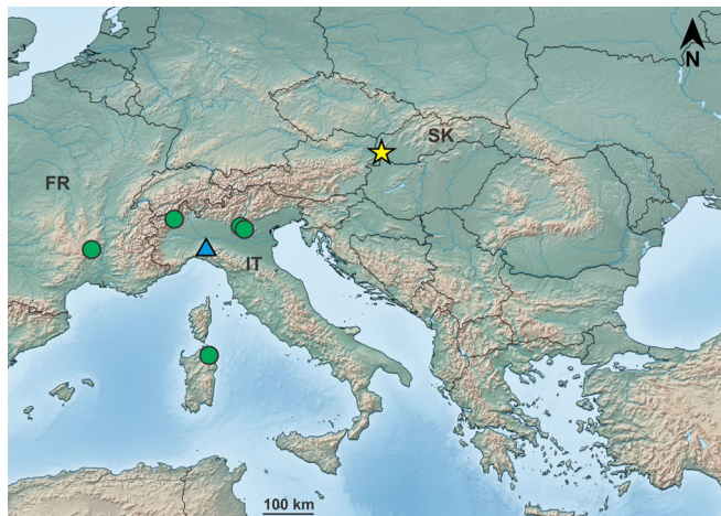
Fig. 1: Distribution of Allochernes solarii . Abbreviations: Blue triangle – the type locality of the species in Italy (IT), green circle – localities in Italy, Sardinia and France (FR), yellow star – newly discovered locality in Slovakia (SK)

from Riva Valdobbia near Vercelli (Piedmont) and Mt. Pastello near Verona (Venetia), both from ant nests ( Formica sp., Lasius sp.), were mentioned by Gardini (2004). In Slovakia, three Allochernes species are known: A. peregrinus Lohmander, 1939, A. powelli (Kew, 1916) and A. wideri (C.L. Koch, 1843) (Christophoryová et al. 2011, 2012). The aim of the present paper is to describe the newly found specimens of A. solarii from Slovakia and re-describe the holotype from Italy.