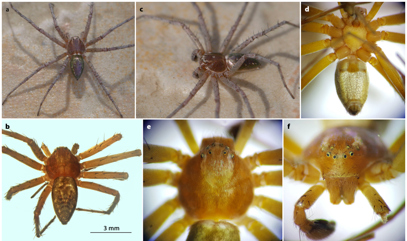
Fig. 1: Philodromus musteri spec. nov. male holotype. a-b. dorsal view; c. lateral view; d. ventral view; e. prosoma, dorsal view; f. prosoma, dorso-frontal view (a, c: living specimen; b, d-f: ethanol preserved specimen)

view (Figs 2c, 3b); RTA robust, pointing outwards, distally truncated (Figs 2, 3d), the ventral (black arrow, Fig. 2a) and dorsal (white arrow, Fig. 2g) borders straight. Cymbium asymmetrical, markedly widened prolaterally; cymbial process moderately protruding as a transparent, rounded lamella. Tegulum, subcircular, prolateral side with projection, visible in ventro-prolateral view (white arrow, Fig. 2e); retrolateral tegular projection barely developed; intertegular retinaculum discreet, visible in ventro-retrolateral view (Fig. 2d). Descending part of sperm duct loop pointing to retrolateral corner of cymbium (white arrow, Fig. 2a). Embolus, sickle-shaped, regularly curved, embolar base weakly thickened on its inner side, originating near mid-half of tegulum.