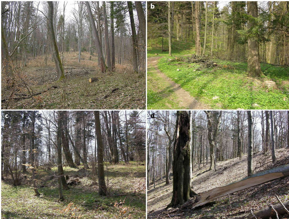
Fig. 2: Sampling sites at Stebnicka Magura. a. Mnichovský potok (stream) (locality № 1); b. Tri studničky (locality № 3); c. Below the border of a nature reserve (locality № 5); d. Vykrývač (locality № 7)

was less abundant (33 specimens, four taxa); Cheiridiidae and Chernetidae were represented by only one species each (and each species represented by two specimens). A total of 129 specimens were collected from seven localities at Stebnicka Magura. Neobisium sylvaticum , N. erythroductylum , Ephippiochthonius boldorii , E. tetrachelatus and Roncus sp. were recorded only in the East Carpathians PLA. Roncus sp. and some species of Neobisium spp. were only identified to genus level.