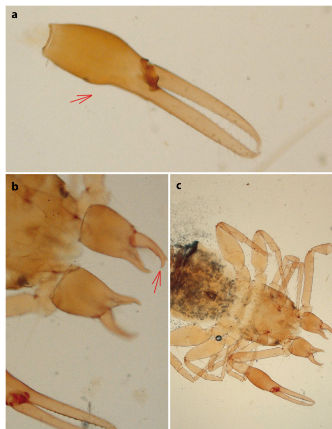
Fig. 3: Ephippiochthonius boldorii , specimen originates from Udava. a. hand of a pedipalpus (arrow = chelal hand with a distinct dorsal depression); b. claws (arrow = cheliceral movable finger without isolated subdistal tooth) on left chelicera; c. body (prosoma), ventral view of E. boldorii

Remarks. Ephippiochthonius tetrachelatus is considered a eurytopic, mainly epigeic species and often represents the most commonly collected species from the family Chthoniidae (Holecová et al. 2012, Christophoryová 2013, Jászayová & Christophoryová 2019, Jászayová & Jászay 2021). Ephippiochthonius tetrachelatus often occurs in leaf litter along southern exposed forest edges or inside sparse forests; it is also fre-