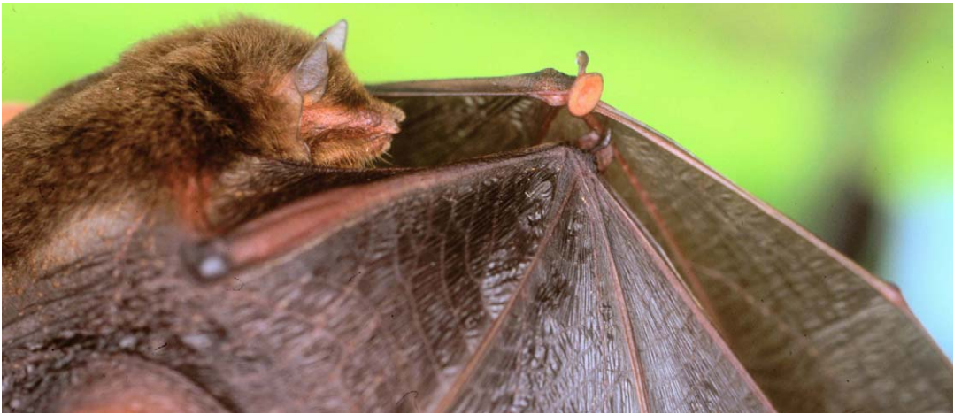
FIG. 1. Specimen of Thyroptera lavalii (FMNH 174916) caught in Maskoitania, Alto Madre de Dios River, Manu Biosphere Reserve, Peru. Notice the size and oblong shape of the suction-disc

anteriorly; (2) two-cusps, axis parallel to sagittal axis; (3) three-cusps, axis converging anteriorly.