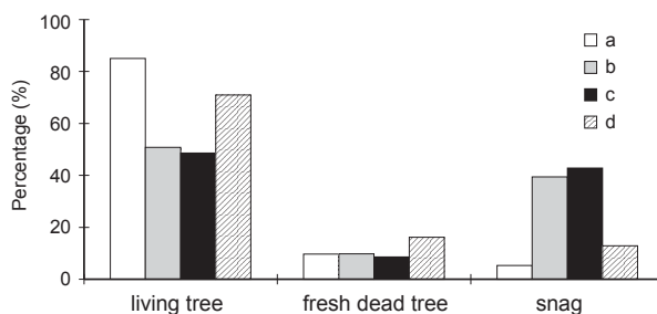
Fig 3. Tree condition of trees systematically sampled in plots (a, N = 863), trees with holes (b, N = 157), nest trees of excavators (c, N = 35) and nest trees of non-excavators (d, N = 62).

larger trees more than excavators ( \chi^2 = 10.1 , df = 2 , p < 0.01 ). The DBH of trees used by non-excavators was not significantly different from that of hole trees (Fig. 2).