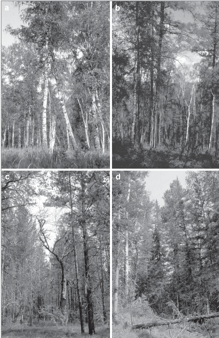
Fig. 1. Habitats sampled in the study. a — mature birch-larch forest, b — young birch-larch forest, c — riparian mixed forest,

1) Mature birch-larch forest (Fig. 1a) — a deciduous forest dominated by large birches. Canopy is rather open with scattered emergent old larches.