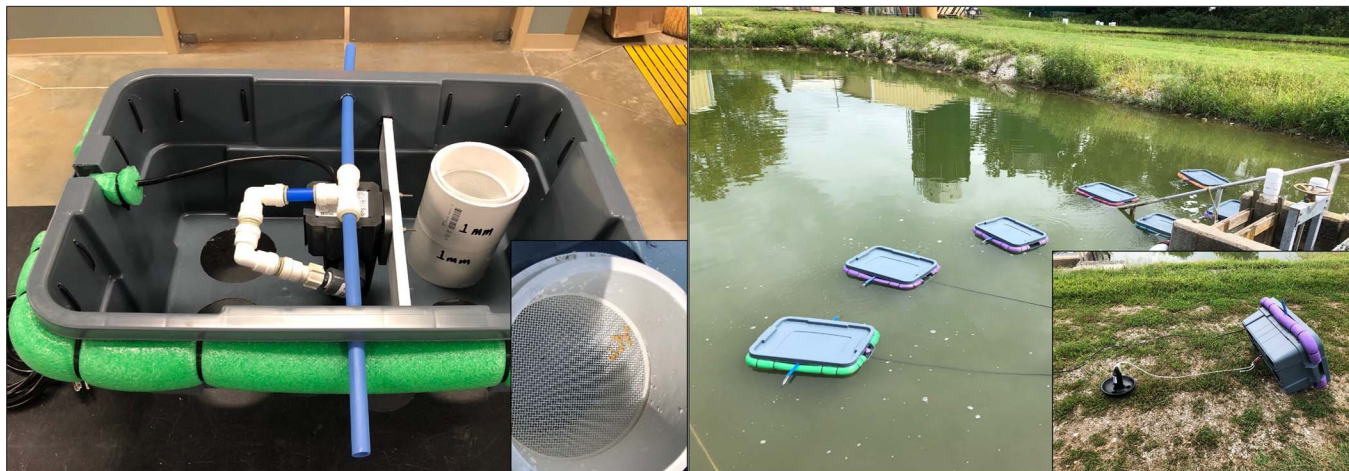
Figure 1. Floating upweller system (FLUPSY) used to hold juvenile mussels in the grow-out pond. (Left) Interior of FLUPSY with cover removed showing polyvinyl chloride holding chamber and water pump. (Right) FLUPSYS deployed in the grow-out pond. Inset shows anchor and line used to hold FLUPSYS in place.

cycle (Kunz et al. 2020). We conducted the bioassay at 23°C in a temperature-controlled water bath and ambient laboratory light (~500 lux) with 16:8-h light:dark photoperiod.