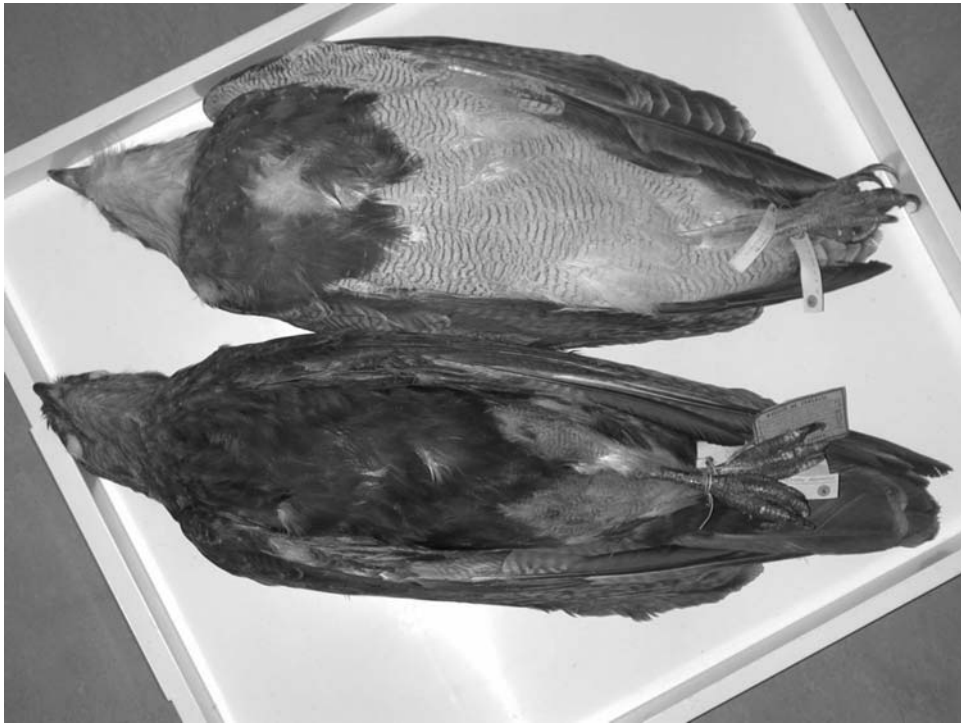
Figure 1. Comparison of the underparts of a normal adult Black-chested Buzzard-Eagle (top) and the melanistic specimen (bottom). Note that belly and flanks of the melanistic bird are uniformly dark, same as the breast, and that the leg feathers are a darker gray. Natural History Museum.

This overall dark raptor differed from normal adults of this species by having completely dark underparts (Fig. 1). Note that immatures of this species have dark plumage (Fjeldså and Krabbe 1990, Birds of the high Andes . Zool. Mus. Univ. and Appollo Books, Copenhagen and Sverdborg, Denmark). Leg feathers of the melanistic specimen were similar to those of normal adults except that the base color was a darker gray. Normal adults have whitish spotting on their dark breasts and whitish throats, bellies, and undertail coverts, with narrow dark barring on the latter two in the race australis that occurs in Ecuador. The head and upperparts of this dark specimen are also dark slate or sooty-gray, lacking the whitish spots on the nape and gray tones of normal adults (Fig. 2). Its upperwing coverts are similar to those of normal adults, but are a darker gray with still darker and coarser barring. Its underwing coverts and axillars are sooty-gray with darker coarse barring, compared to white with fine gray barring on normal adults.