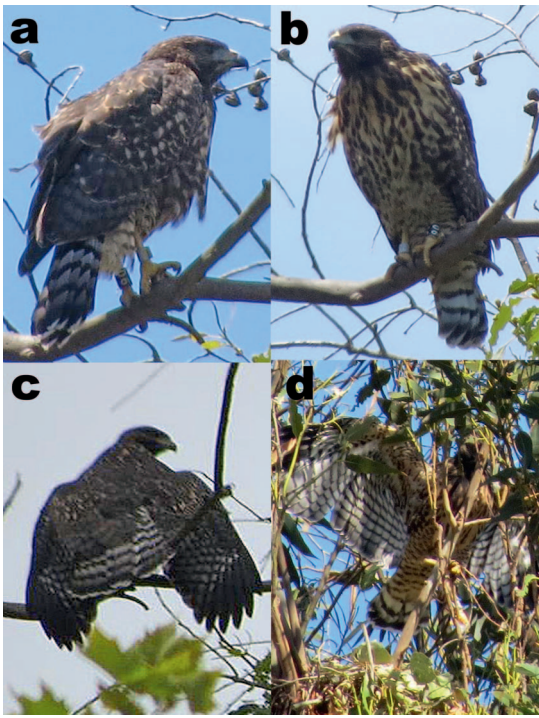
Figure 3. 2014 Common Black Hawk \times Red-shouldered Hawk hybrid's juvenile plumage at age 56 d old (a–c) and 46 d old (d). (a–b) Brown, streaked head and facial pattern resemble Red-shouldered Hawk except for wide, dark brown malar stripe; (a) Dark brown dorsum and absence of rufous shoulder patches resemble Common Black Hawk; (b) Buffy to cream venter heavily marked with dark brown spots and streaks; (c) Wavy lines in tail resemble Common Black Hawk; (d) Ventral barring of remiges resembles Red-shouldered Hawk.

hybrids based on appearance alone and recommend genetic investigation. Although we lack genetic evidence of hybridization, we provide strong behavioral evidence to corroborate the morphological and plumage-based evidence: SM observed the pair engaged in courtship displays, copulations, simultaneous nest attendance, and food provisioning of the hybrid offspring (Fig. 1).