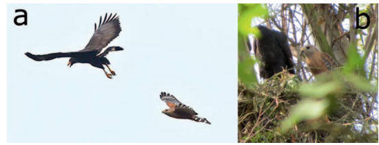
Figure 1. Intergeneric hybridization of a female Common Black Hawk and a male Red-shouldered Hawk, near Graton, Sonoma County, California, USA, 2014: (a) Pair engaged in aerial courtship on 22 March 2014; photo by N. Dunlop; (b) Pair standing on nest containing a hatchling (not visible) on 15 May 2014; photo by S. Moore.

During the incubation phase (four visits), the Common Black Hawk was the only parent observed on the nest. SM first observed her incubating on 11 April. On 15 May, after 34 d of incubation, the Common Black Hawk assumed a brooding posture, indicating at least one hatchling. SM first observed a nestling on 20 May.