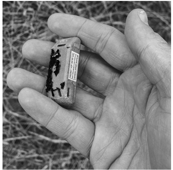
Figure 4. OrniTrack-10 GPS-GSM transmitter recovered from an adult female Gray Hawk 20 d after deployment; none of the Teflon harness material was found. We initially assumed the hawk had been killed because of the complete removal of the harness and most of the neoprene, but she was later resighted.

Four of six Gray Hawks equipped with Teflon harnesses and GPS-GSM transmitters removed their harnesses within 10 wk. All seemed to easily chew through the Teflon anywhere they could reach it, whether through the straps or the knots (Fig. 3, 4). Only one of 48 Gray Hawks, an adult female, removed a Spectra harness. She accomplished this by chewing through the sternum-connecting-ribbon (Fig. 5). After we began using Spectra harnesses, modifying the sternum-connecting-ribbon, and reinforcing stitching at the attachment knots, no Gray Hawks removed their Spectra harnesses ( n = 47 ). We recovered the transmitters and harnesses after five mortalities, and no portion of the Spectra ribbon had been damaged, including the knots (Fig. 6). At the time of writing in early 2021, 21 GPS-GSM transmitters were still deployed and birds had been wearing the harnesses an average of 273 \pm 56 d (SD). Similarly, 14 VHF transmitters had been deployed for an average of 257 \pm 80 d.