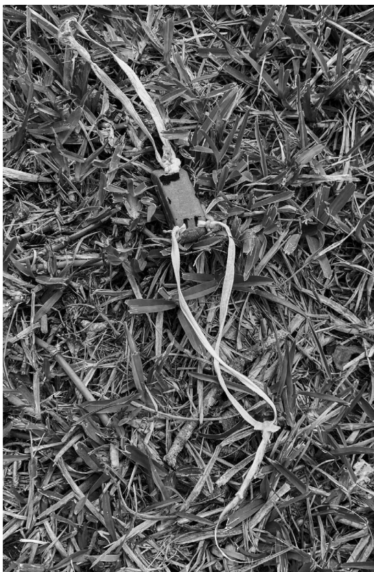
Figure 5. OrniTrack-10 GPS-GSM transmitter with what remained of the Y-transmitter Spectra harness, recovered from an adult female Gray Hawk. She removed the harness by biting through the sternum-connecting-ribbon in <27 d.

E10 transmitter had solar panels sufficiently elevated to preclude coverage by nape feathers, whereas our attempts to post-modify the original OrniTrack-10 transmitters to accomplish this were not successful.