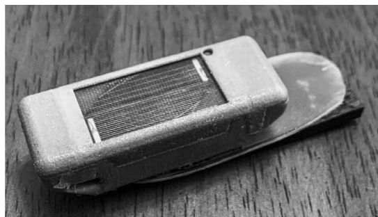
Figure 2. OrniTrack-10 GPS-GSM transmitter with 54-mm long piece of neoprene and flexible plastic cutting board mat extending 20 mm towards the nape. This was intended to cover and divert the bird's nape feathers so they would not obscure the solar panel.

We initially used a Y-transmitter harness attachment design similar to Buehler et al. (1995), with 6.35-mm wide natural tubular Teflon tape (Bally Ribbon Mills, Bally, PA, USA) and neoprene padding at the suture points (Millsap et al. 2013). We used waxed dental floss rather than nylon thread for securing the 30-cm straps. We added pieces of neoprene to the bottom of the transmitter and to the sternum-connecting-ribbon for comfort; the pieces were cut to fit the length and width of the transmitters and the sternum-connecting-ribbon, then attached using contact cement or stitching. The sternum-connecting-ribbon was 2 cm for males and 4 cm for females. We used Gorilla