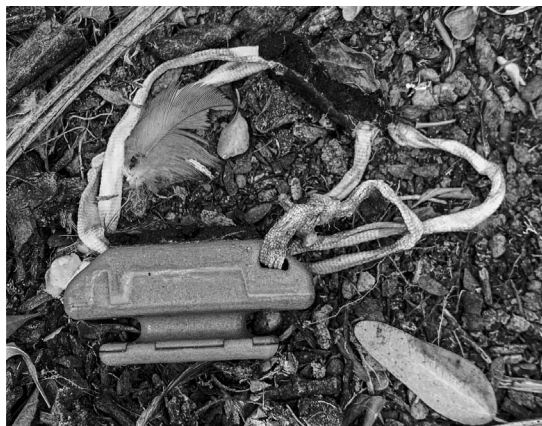
Figure 6. OrniTrack-E10 GPS-GSM transmitter with an intact Y-transmitter Spectra harness, recovered from an adult male Gray Hawk that was apparently killed by a predator. There was no damage to the straps, knots, or the reinforced sternum-connecting-ribbon after the bird wore the harness for 155 d.