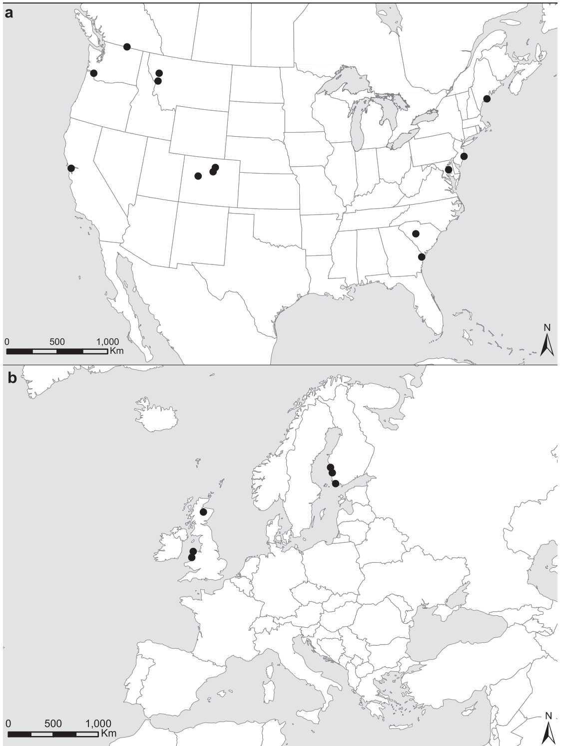
Figure 1. Locations of 19 Osprey nests and web cameras, representing data collected by citizen scientists for one to seven breeding seasons (2014–2020): (a) North America, (b) Europe.