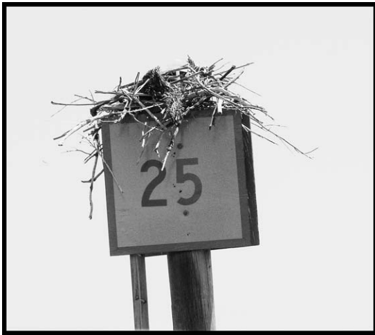
Figure 1. An Osprey nest built on an aid to navigation (e.g., channel marker) that poses a conflict.