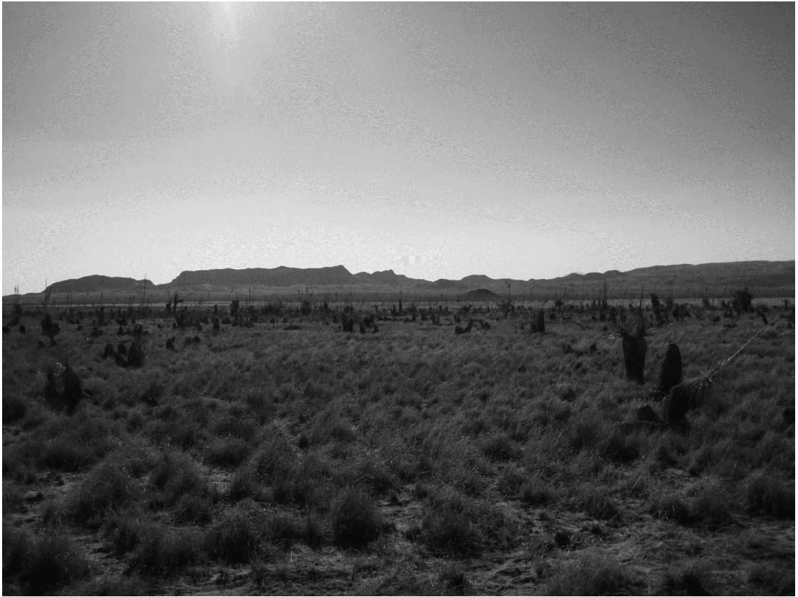
Figure 2. Open grassland savanna with scattered tree yuccas in the central portion of the Armendaris Ranch.

40 d of free-flying experience, owing to their captive origins. We proposed that extending the feeding program would allow these birds to gain more experience, without being food-stressed, which could increase their survival.