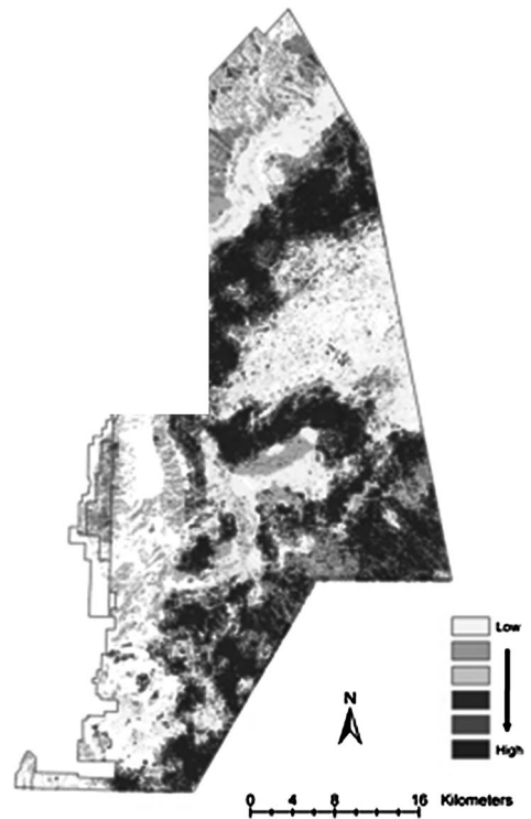
Figure 1. Habitat suitability model for Aplomado Falcons on the Armendaris Ranch. Map subset from model detailed in report (Young et al. 2002).

The Peregrine Fund employed standard raptor hacking (reintroduction) procedures for releasing 102 captive-bred Aplomado Falcons at the Armendaris Ranch from 2006 through 2011 in June, July, and August (Hunt et al. 2013). This procedure involved holding juvenile aplomados, with color VID (visual identification) and aluminum U.S.G.S. bands, in a hack box, for 7–10 d, on an elevated platform erected in suitable habitat, and then releasing them at an age when they would naturally fledge (Mutch et al. 2001). On release day, the box was opened remotely allowing the birds to emerge