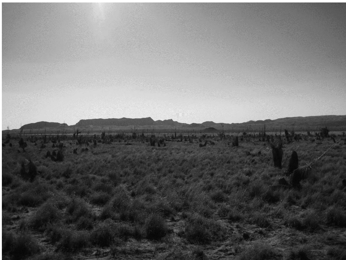
Figure 2. Open grassland savanna with scattered tree yuccas in the central portion of the Armendaris Ranch.

40 d of free-flying experience, owing to their captive origins. We proposed that extending the feeding program would allow these birds to gain more experience, without being food-stressed, which could increase their survival.