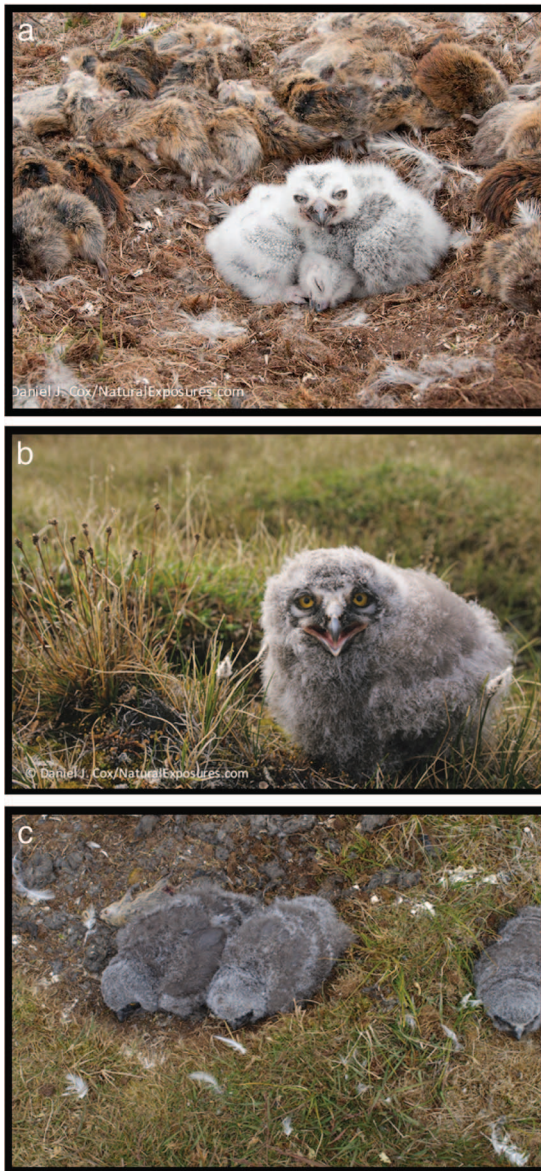
Figure 3. (a) Eyes yellow-gray and open fully by 9–11 d. (b) Nestlings gray with frosted tips to mesoptile down; primary quills emerge by day 14. (c) Nestlings gray, tail quills visible, primary feathers erupt, surge in mass gains, very mobile, 15–21 d.

mesoptile (second) natal down at about 1 wk of age, and within 2 wk of age they were mostly covered in the mesoptile down. These findings were similar to other studies (Sutton and Parmelee 1956, Watson 1957, Tulloch 1968, Potapov and Sale 2012).