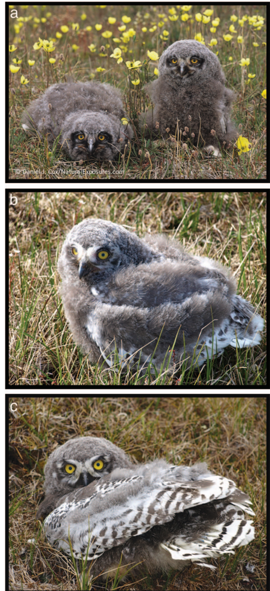
Figure 4. (a) Very mobile, can run, departs nest about 3 wk old, tail feathers conspicuous. (b) Eyes deeper yellow; juvenile plumage emerges, showing white X on face 22–28 d; tail quills erupt about 25 d. (c) White mask forms on face, juvenile upper wing coverts and flight feathers distinct at 29–35 d.

mesoptile (second) natal down at about 1 wk of age, and within 2 wk of age they were mostly covered in the mesoptile down. These findings were similar to other studies (Sutton and Parmelee 1956, Watson 1957, Tulloch 1968, Potapov and Sale 2012).