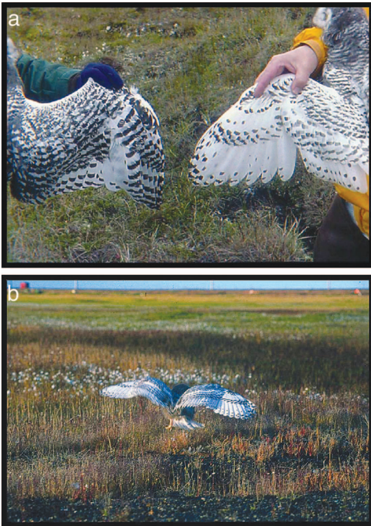
Figure 5. (a) Distinct plumage patterns suggest sex differences between male and female at 36–43 d. Notice less barring and more spotting on male secondaries and more barring and less spotting on female secondaries. (b) Young fledge around 44–55 d.

(see Bruce 1999, Holt et al. 1999, König and Weick 2008), and mesoptile down varies in color among species. Most species of owls are nocturnal or active at low-light levels, and only females incubate and brood. Thus, we hypothesize that there is no need for eggs or nestlings to evolve cryptic coloration because they are almost constantly covered by the female. Thus, white may be a neutral or default color favored by natural selection, and energetically cheaper to produce.