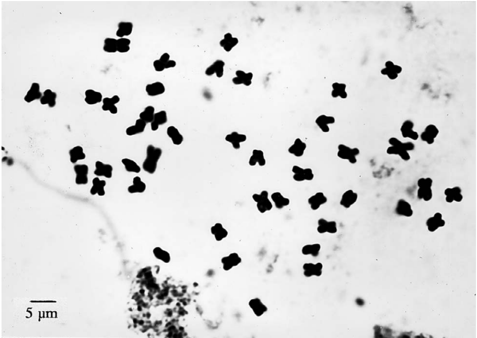
Fig. 2. Mitotic metaphase of A. verlotiorum (Yerevan, Nalbandian street; 2n = 48 ).

explain deviating reports of 2n = 54 (Vignoli 1945, Sokolovskaya 1960). The reports of 2n = 16 and 2n = 18 chromosomes – the latter more surprising – by Kawatani & Ohno (1964) may be due to misidentification of the material, as it was the case by Oliva Brañas & Vallès Xirau (1991), who counted 2n = 16 in a Russian population determined as A. verlotiorum , a determination later corrected to A. vulgaris in a more detailed work on the same population (Oliva Brañas & Vallès Xirau 1994).